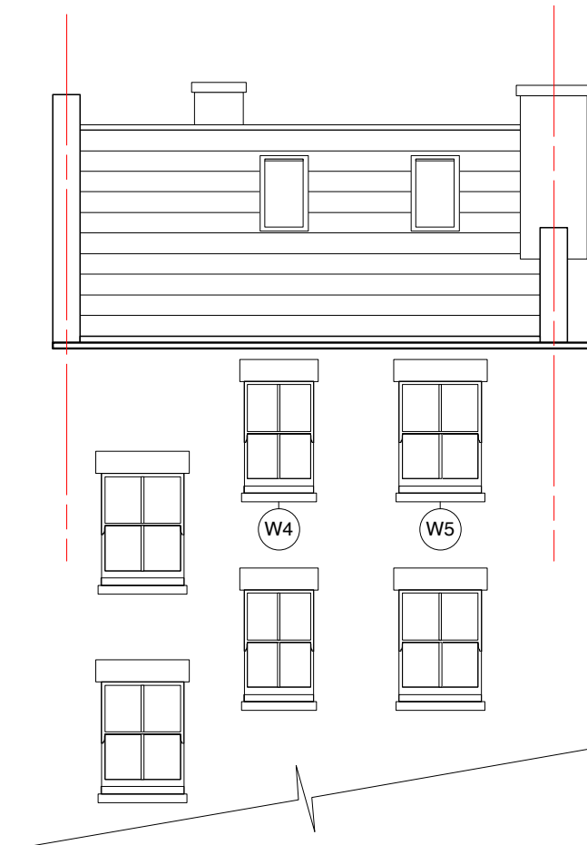
Part Front Elevation as existing scale 1:100