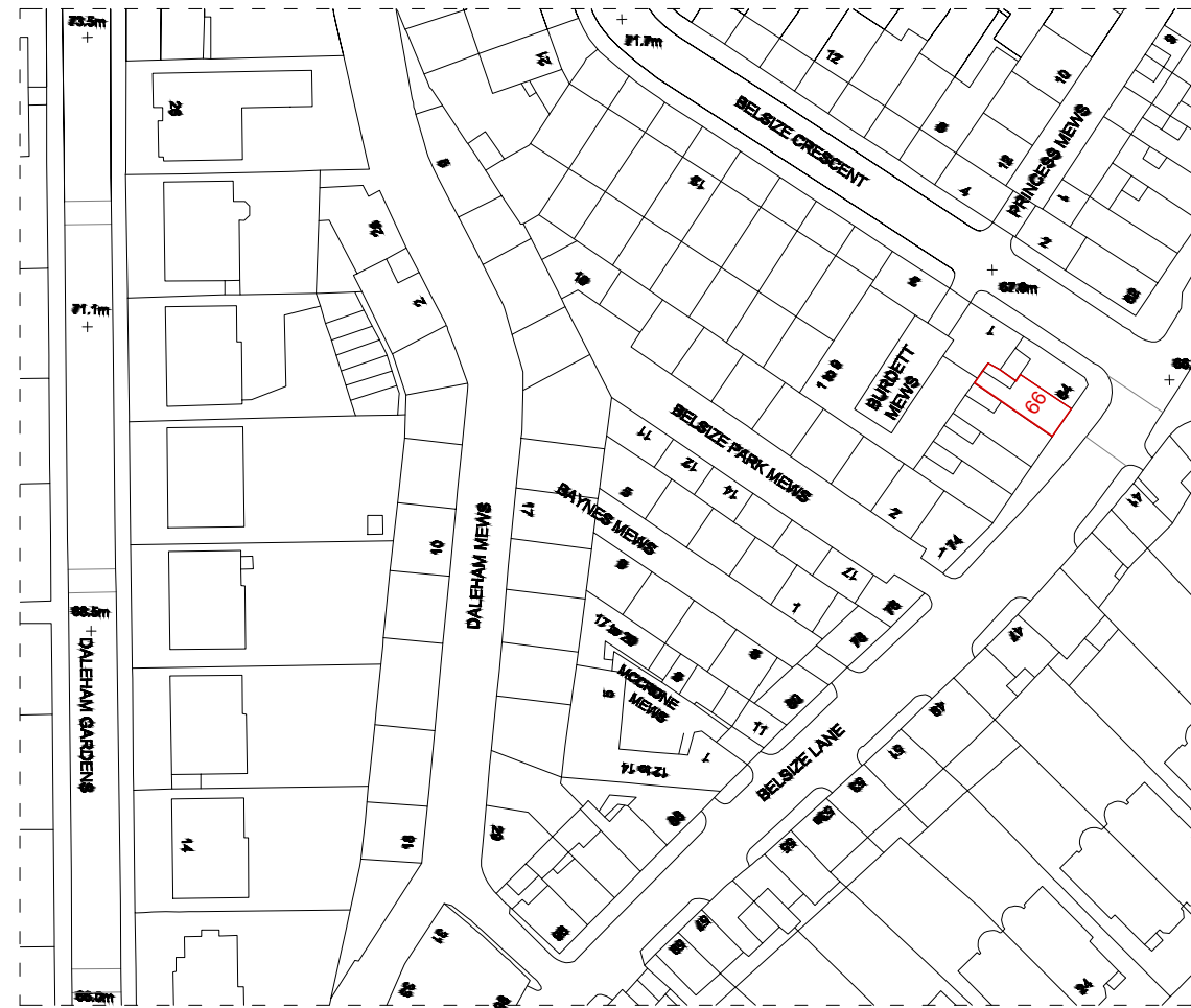
LOCATION PLAN SCALE: 1/1250

notes: The contractors are to check all dimensions, drain runs and general conditions on site before works commence, and inform Akelius immediately upon discovery of any errors, omissions or discrepancies. All works are to be carried out in accordance with current building regulations, British standards, codes of practice and local authority requirements.