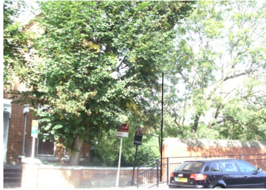
LOCATION WITH POLE Front wall of 26 Minster Road with pole at right hand end