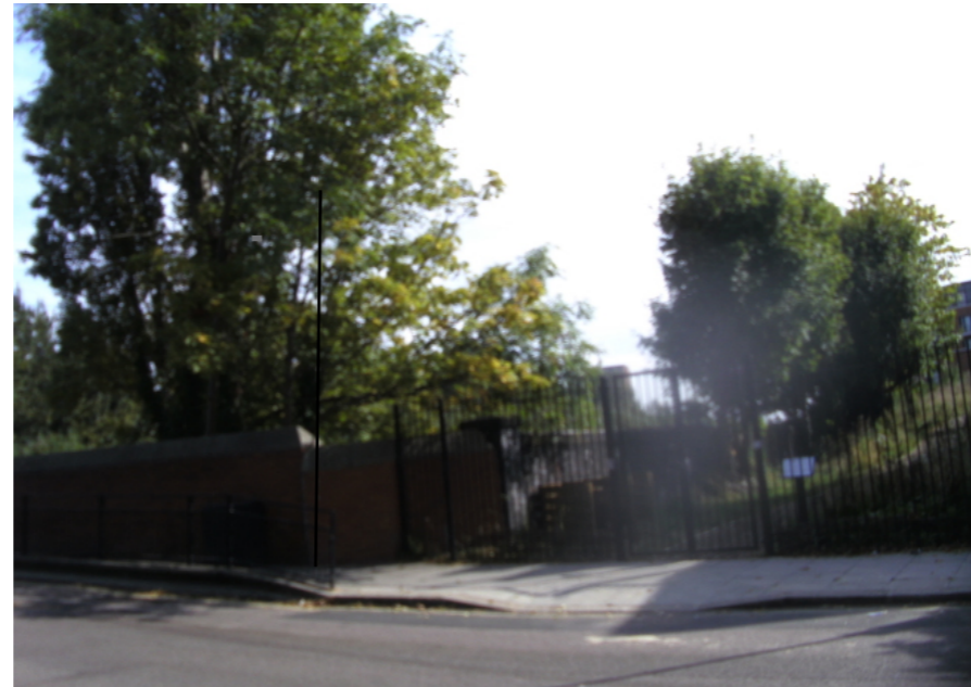
LOCATION WITH POLE Wire mesh gates to Nature Conservancy Area with pole to left hand side, adjacent to end of railway bridge wall