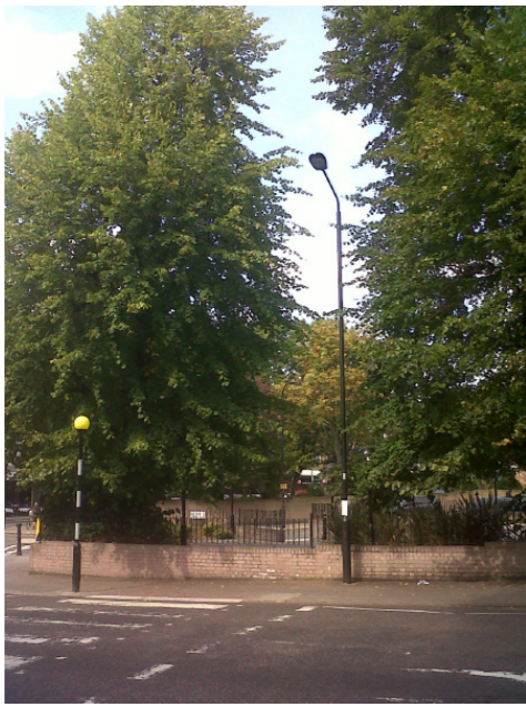
LAMP POST IN FRONT OF 1-16 HILGROVE ROAD