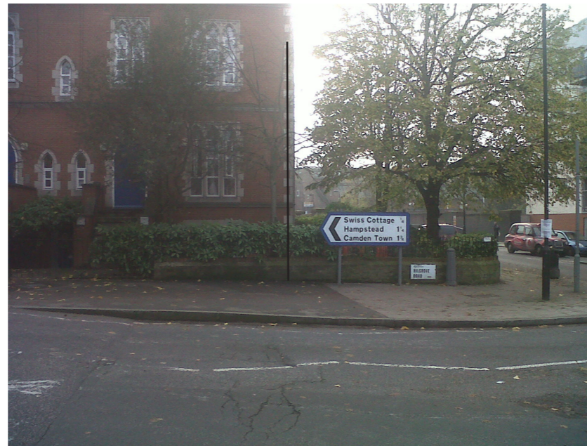
LOCATION WITH POLE Dwarf wall and railings to 22-24 Hilgrove Road with proposed pole to left of road direction sign