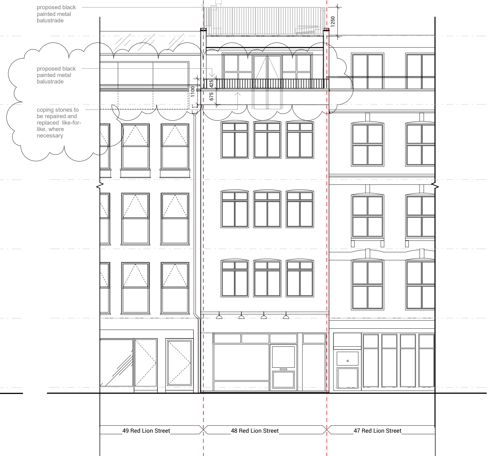
2 Proposed Street Elevation 332-001 1 : 100