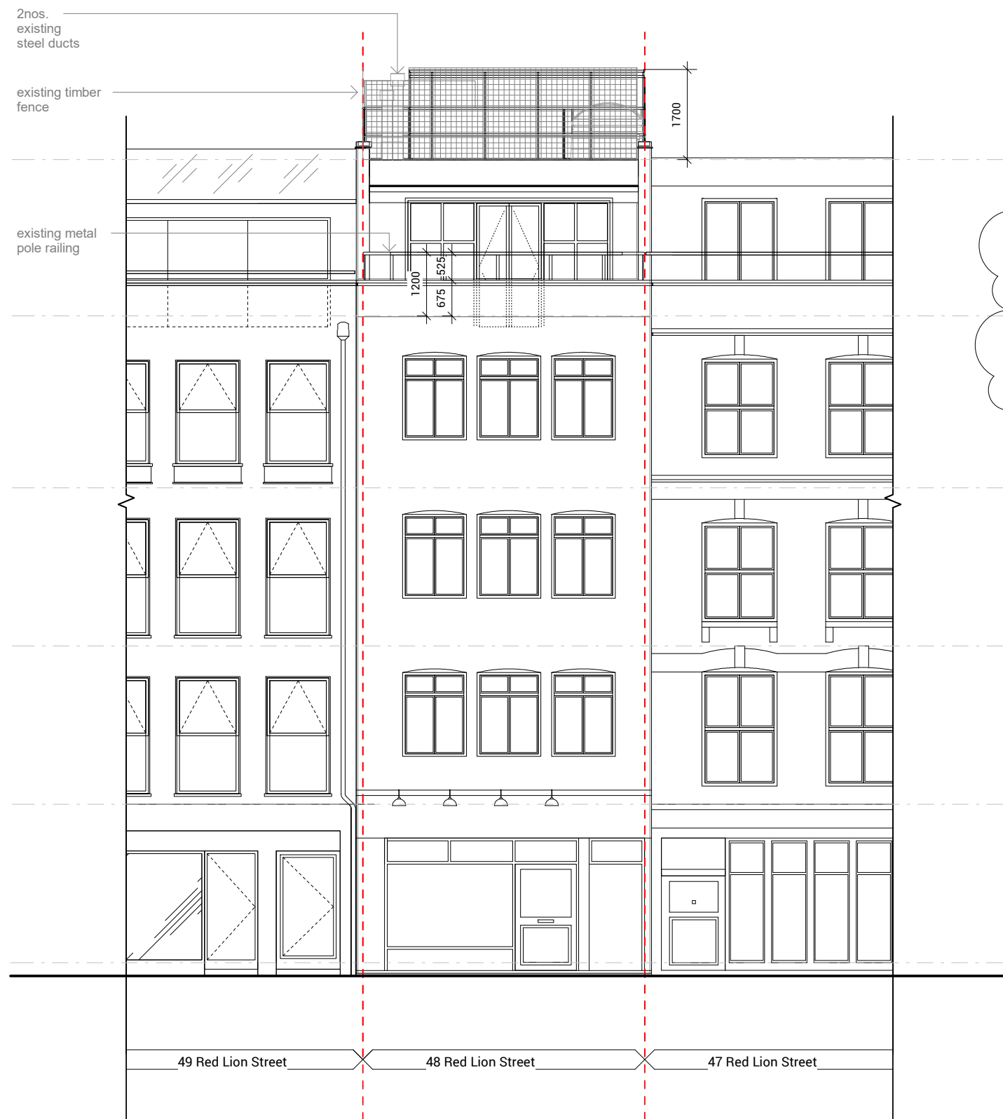
1 Existing Street Elevation 332-001 1 : 100