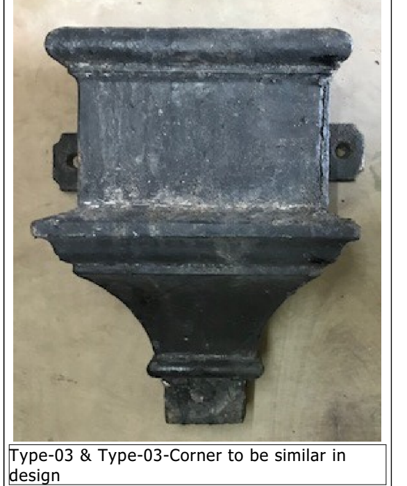
Type-03 & Type-03-Corner to be similar in design.