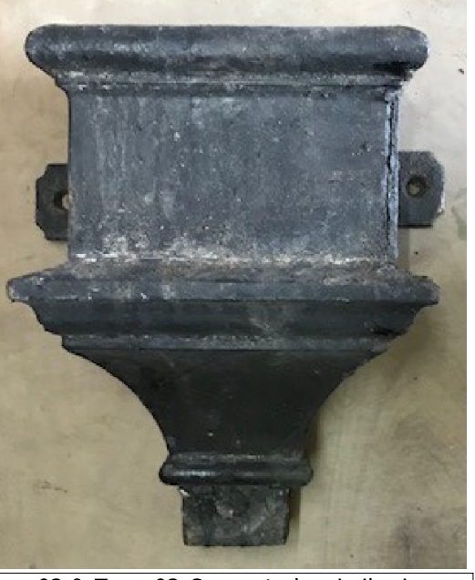
Type-03 & Type-03-Corner to be similar in design