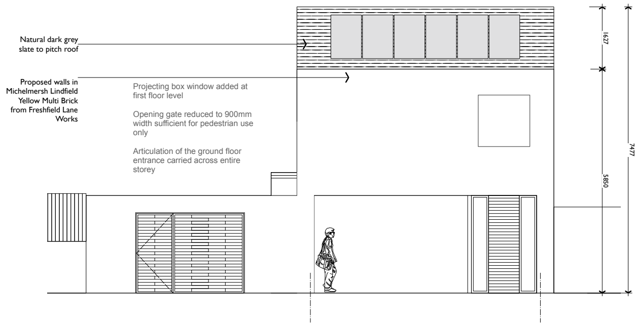
01 ENTRY (SOUTH) ELEVATION ALTERNATE, ALONG ROCHESTER MEWS