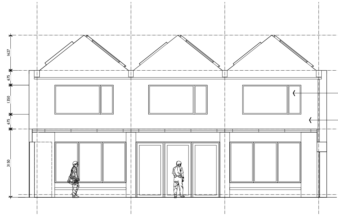
02 GARDEN (WEST) ELEVATION