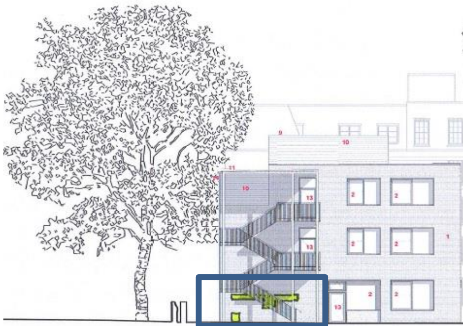
Figure 3: Proposed plant location (elevation)

1.7. The humidifier unit is to be located externally underneath the stairwell at ground level and is external to the building.