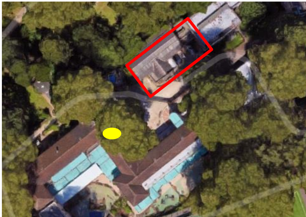
Figure 1: Approximate site location

1.4. It is understood currently a swimming pool exists on the proposed site, this is due for demolition with the proposed Coram QEII Centre to be built in its place.