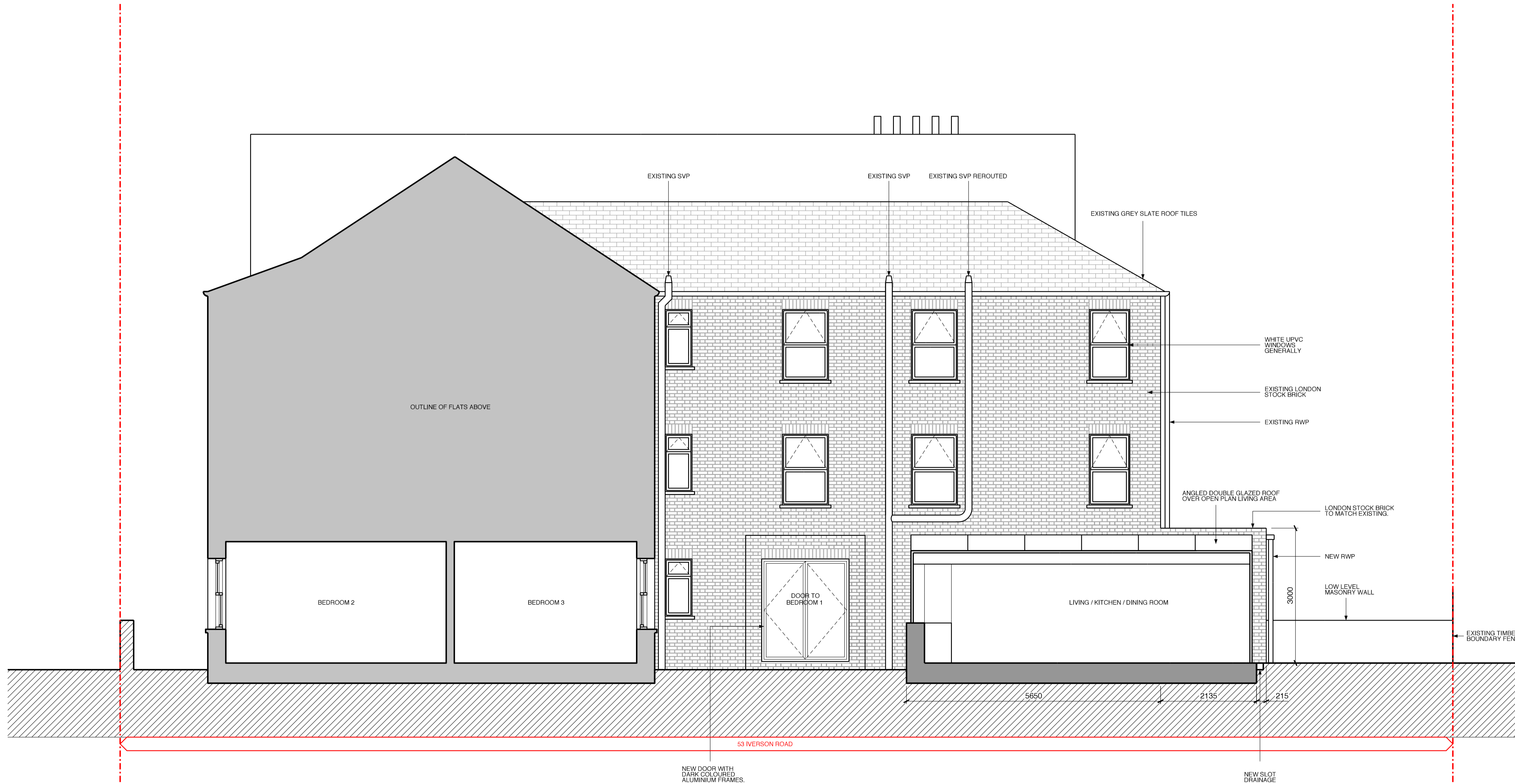
PROPOSED SECTION AA