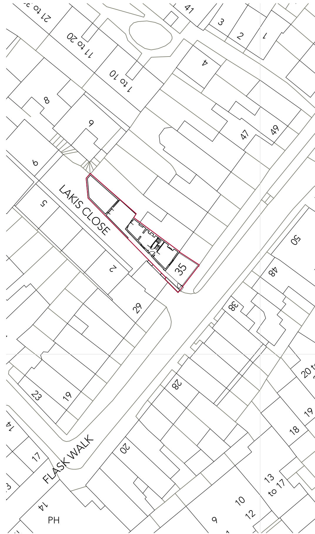
2 EXISTING SITE PLAN scale 1:500