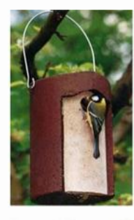
Bird Box Type 2 1B Schwegler Nest Box