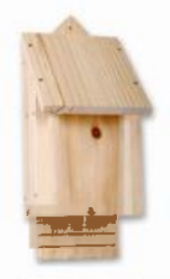
Bat Box Type 1 Ark Wildlife Natural Timber Bat Box