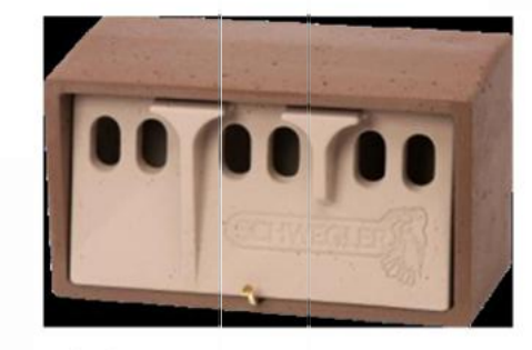
Bird Box Type 1 ISP Schwegler Sparrow Terrace

NOTE: HEADLESS OR DOMED NAILS NOT HAMMERED HOME TO BE USED TO FIX BOXES TO TREES TO ALLOW TREE GROWTH AND REGULAR CHECKS TO BE UNDERTAKEN TO ENSURE THAT THIS ALLOWANCE CAN BE MADE WHILE STILL BEING SECURELY FIXED. IRON NAILS TO BE USED ON TREES WITH NO COMMERCIAL VALUE NOTE: BAT BOXES WILL BE INSTALLED AT A LEVEL THAT IS AT LEAST 5 METRES ABOVE GROUND WITH CLEAR ACCESS