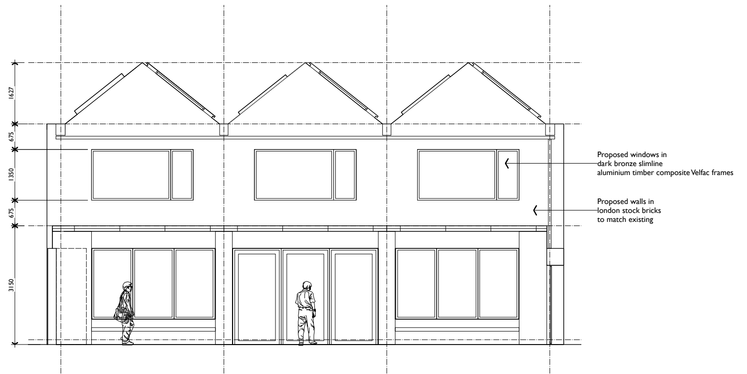
02 GARDEN (WEST) ELEVATION