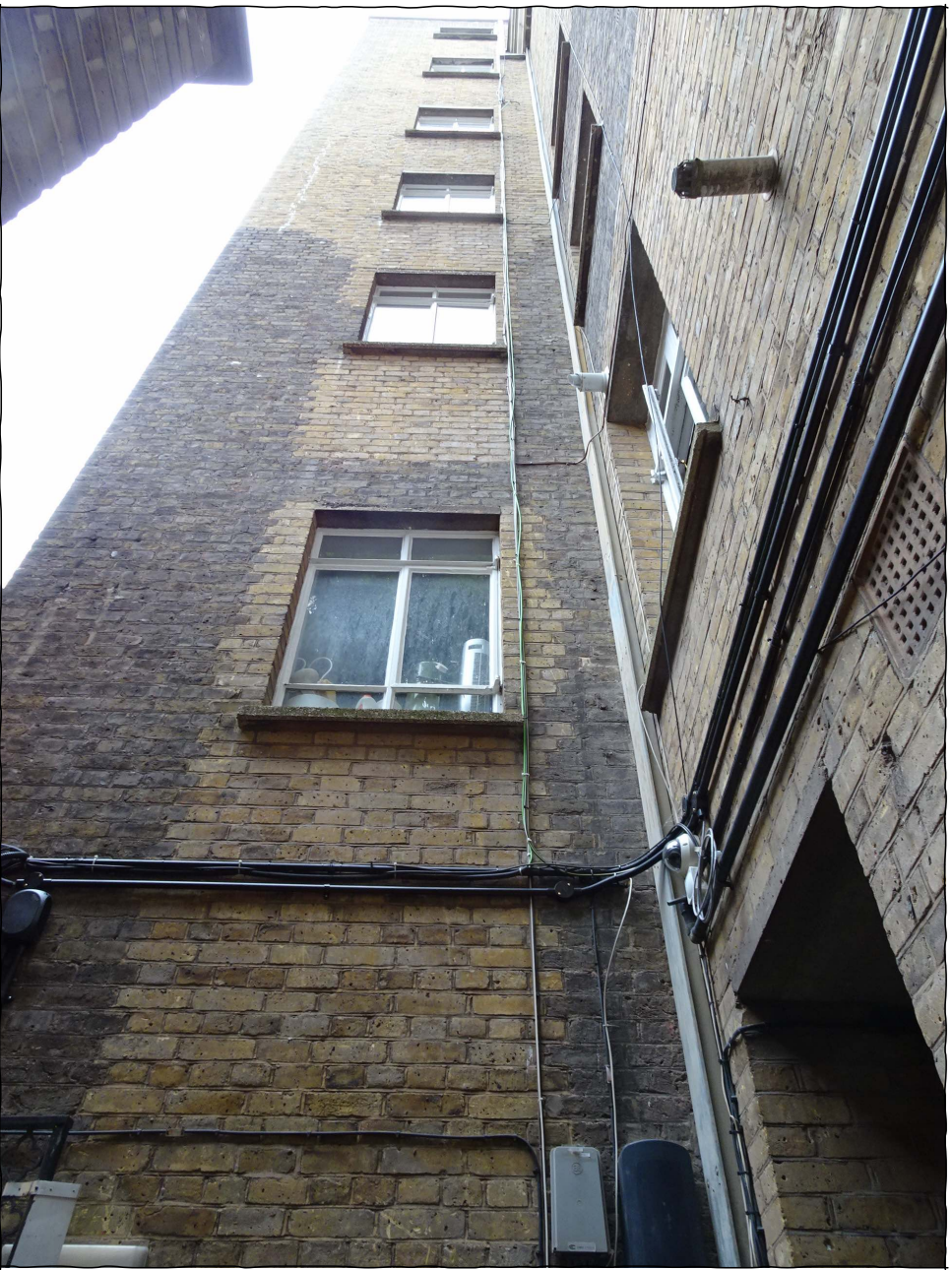
Photograph taken up from Basement Level Lightwell