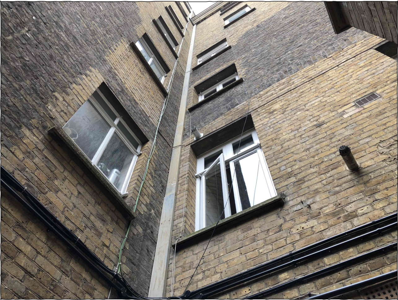
Photograph taken up from Basement Level Lightwell