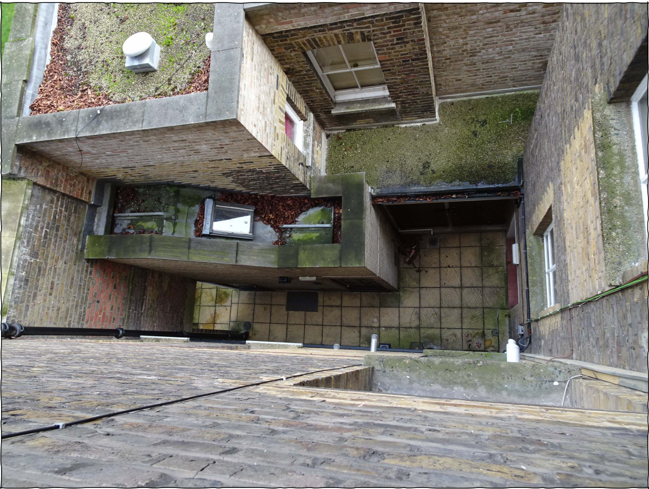
Photograph taken down from Mezzanine Floor Level Window