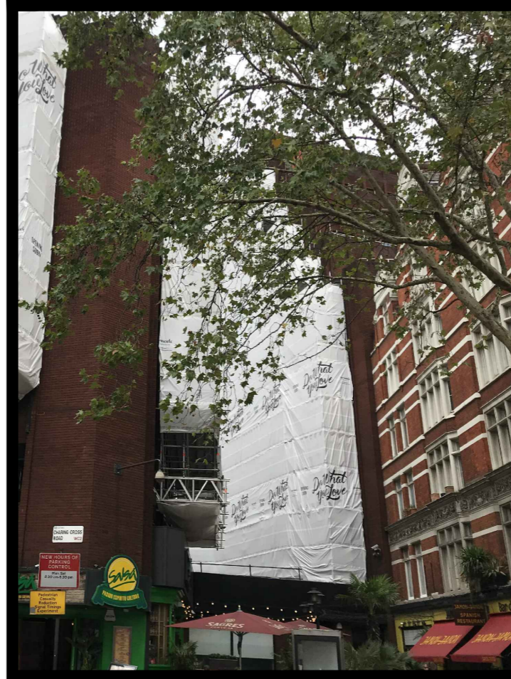
PHOTO VIEW 02. STREET VIEW-CHARRING CROSS