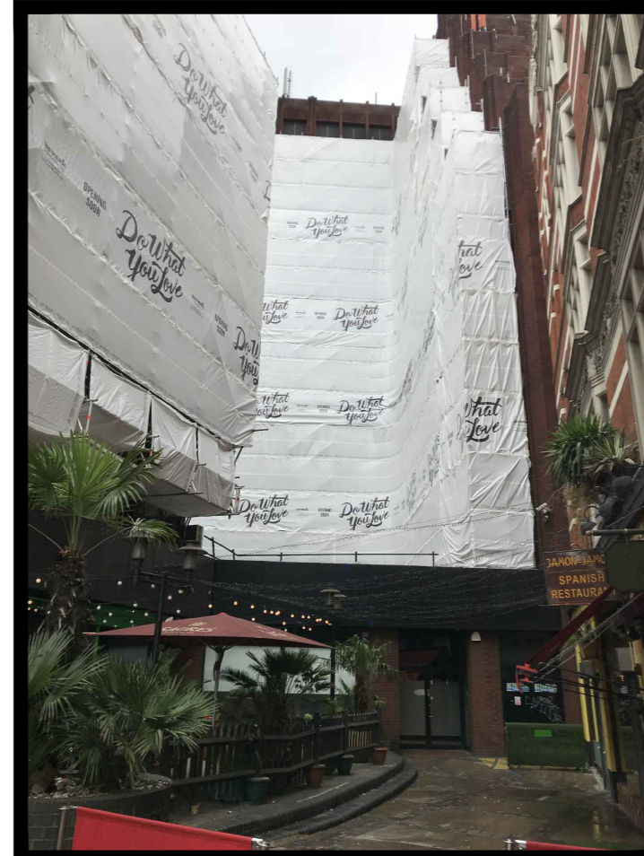
PHOTO VIEW 03. STREET VIEW-CHARRING CROSS

ltb. Aldwych House 71-81 Aldwych London WC2B 4HN