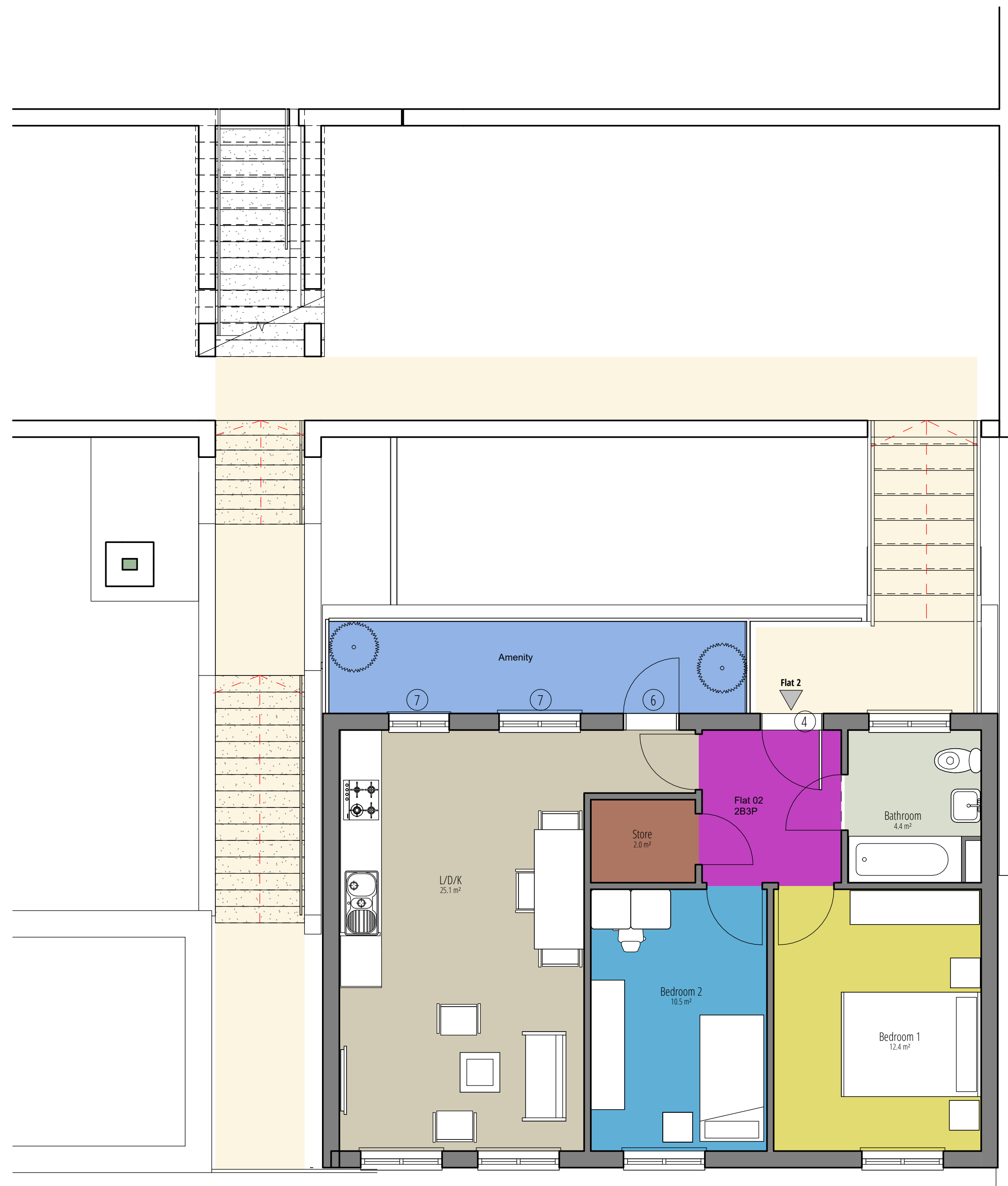
2 Proposed First Floor 1:50