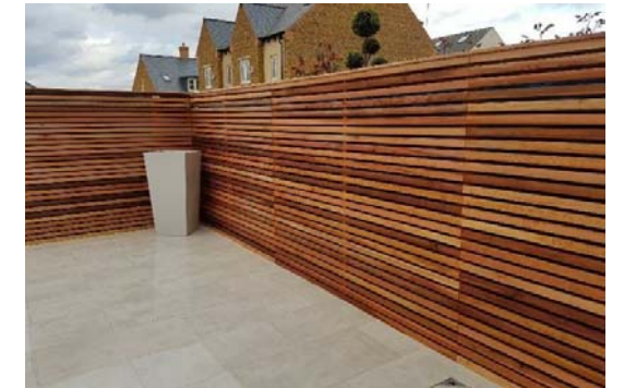
Treated Red Cedar