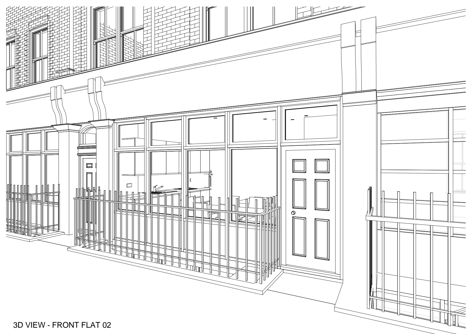
3D VIEW - FRONT FLAT 02