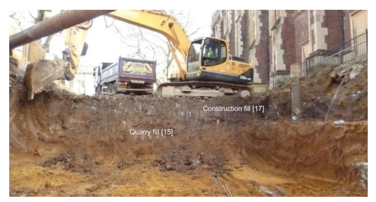
Photo 6 Excavating brickearth quarries beneath the former Under Treasurer's House

4.3.6 The quarry had been cut by a large broad construction cut 2.4m deep [16], which continued beyond the area of the current excavations. This includes the construction cut for the Great Hall and Library, but also includes subsequent constructions of the Under Treasurer's House and for a brick drain that exited the library and flowed northwards (Photo 7). It was filled with loose grey coal-ashy quarry fills [17], mostly reworked earlier quarry fills, which probably raised the ground level of the entire area when the Great Hall and Library was built.