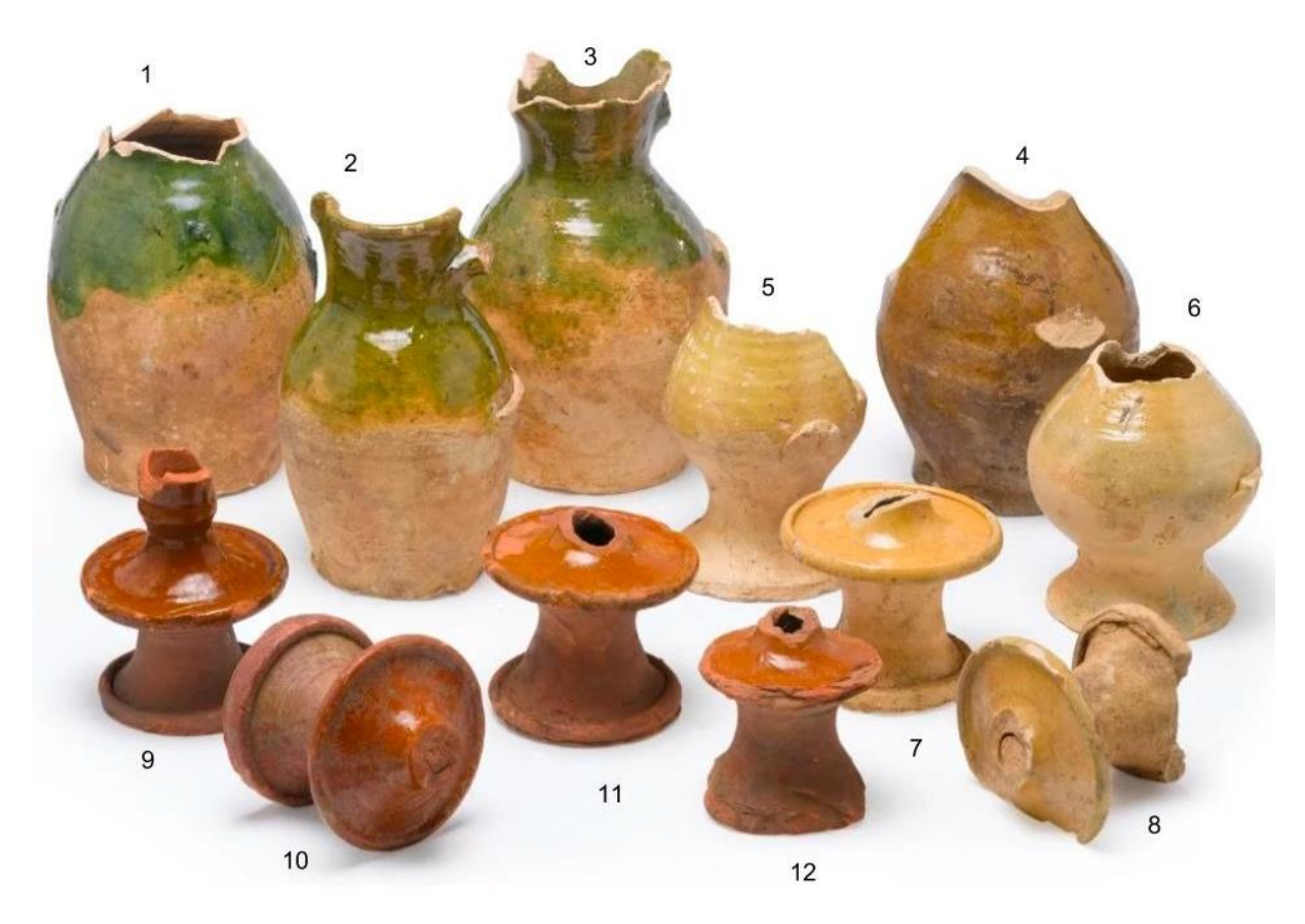
Photo 8 Surrey-Hampshire border whiteware with green glaze, slender rounded drinking jugs, 1–4; whiteware with clear (yellow) glaze, baluster drinking jugs, 5–6; whiteware with clear glaze upright candlesticks, 7–8; redware upright candlesticks, 9–12