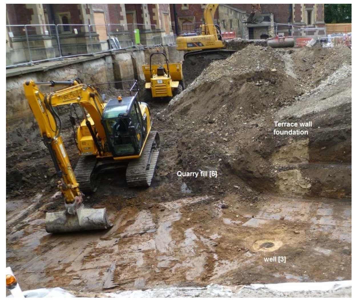
Photo 2 East terrace ground reduction through quarry fills and exposing well [3] looking north.

4.1.6 No clean brickearth survived in this area (unlike the Deep Drainage trench and former Under Treasurer's House excavation area) and it may well be that the reworking of the brickearth may have masked a construction cut for the well, and/or an earlier brickearth quarry. The base of the well extended