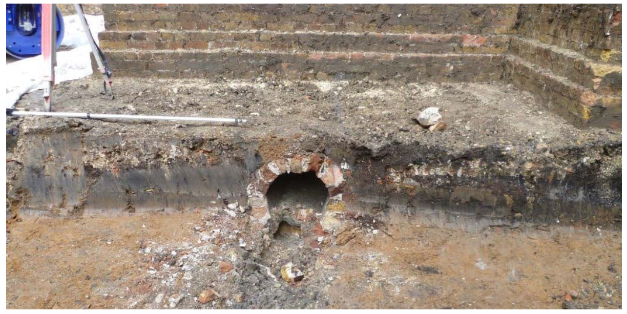
Photo 7 19th-century brick drain built at the time of construction of the Great Hall and possibly at the base of a large construction cut indicated by the change in the colour of deposits

4.3.6 The quarry had been cut by a large broad construction cut 2.4m deep [16], which continued beyond the area of the current excavations. This includes the construction cut for the Great Hall and Library, but also includes subsequent constructions of the Under Treasurer's House and for a brick drain that exited the library and flowed northwards (Photo 7). It was filled with loose grey coal-ashy quarry fills [17], mostly reworked earlier quarry fills, which probably raised the ground level of the entire area when the Great Hall and Library was built.