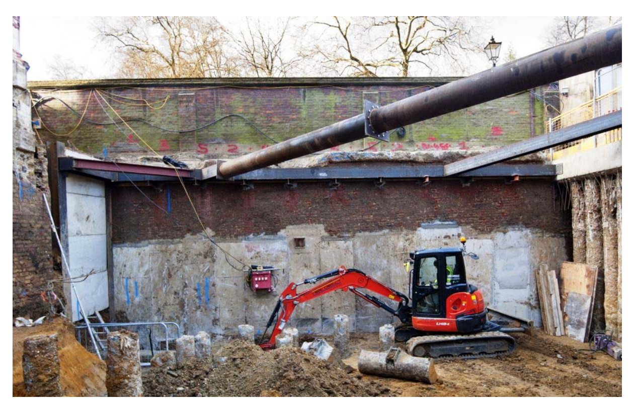
Photo 5 "Tudor" red brick perimeter wall [13] sandwiched between lower concrete underpinning and 19th-century rebuilt perimeter wall above modern ground level (note also natural sand and clay bottom left).

4.3.5 The construction trench for the perimeter wall was filled with reworked brickearth [12] to a height of 19.4m OD. This deposit had been cut through by a large quarry [14], which exceeded the limits of excavation in three directions (Photo 6). It was infilled with loose grey-brown coal-ashy fills [15], measuring more than 1.1m in depth. Unlike the quarries on the East Terrace the fills of this quarry contained clay tobacco pipes. This quarry is likely to be 17th-century in date, but contains material from earlier reworked 16th-century quarry fills.