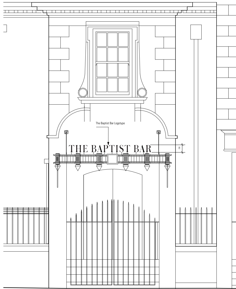
1 Elevation 1:25@A1, 1:50@A3

Information contained within this drawing is the sole copyright of HDDA Ltd, and is not to be reproduced without express permission. No implied licence exists. This drawing not to be used for land transfer or valuation purposes. Do not scale from this drawing. All dimensions & levels are to be checked on site by the contractor. Issued for purposes indicated only. Drawing errors and omissions to be reported to the architect.