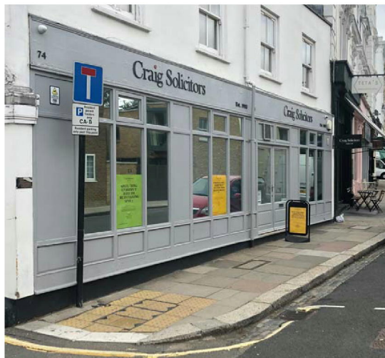
Craig Solicitors, 74 Belsize Lane, NW3 5BJ

For precedents please consider signs at: