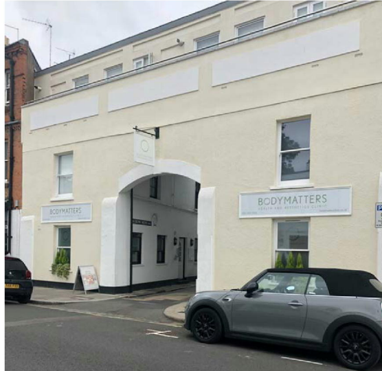
1 McCrone Mews, London NW3 5BG