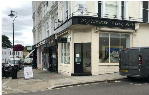
Sylvester Fine Art, 64 Belsize Lane, NW3 5BJ

Taking in consideration the proposed design, precedents and the above analysis, we therefore request that the Council grant consent to display advertisement.