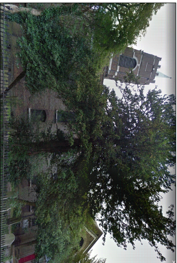
2 NORTH ELEVATION 761x100 nts

GENERAL NOTES: THIS DRAWING IS COPYRIGHT OF LOVE ARCHITECTURE LTD. THIS DRAWING MUST BE READ IN CONJUNCTION WITH THE SPECIFICATION AND ALL OTHER RELEVANT DOCUMENTATION AND DRAWINGS. LOVE ARCHITECTURE ACCEPTS NO LIABILITY FOR ANY EXPENSE, LOSS OR DAMAGE CAUSED BY ANY VARIATION FROM THE DRAWING OR IN THE EXECUTION OF THE WORK TO WHICH IT RELATES WHICH HAS NOT BEEN REFERRED TO THEM AND THEIR APPROVAL OR REVISION. SCALE FROM THIS DRAWING OR THE COMPUTER DIGITAL DATA, ONLY FIGURED DIMENSIONS ARE TO BE USED. IF IN DOUBT ASK.