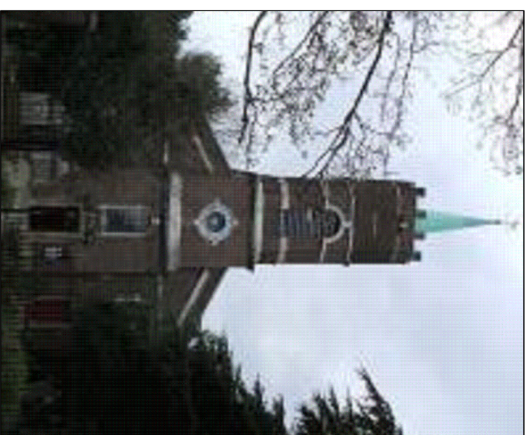
3 EAST ELEVATION 761x100 nts