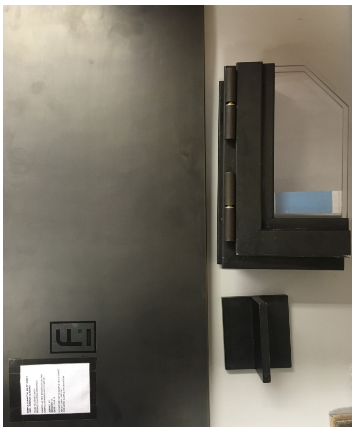
4. Photograph showing Window corner sample, Bronze Fin / Trim profile, and Bronze Cladding. All Materials use the same brass specification with the same pre-patination (dark).