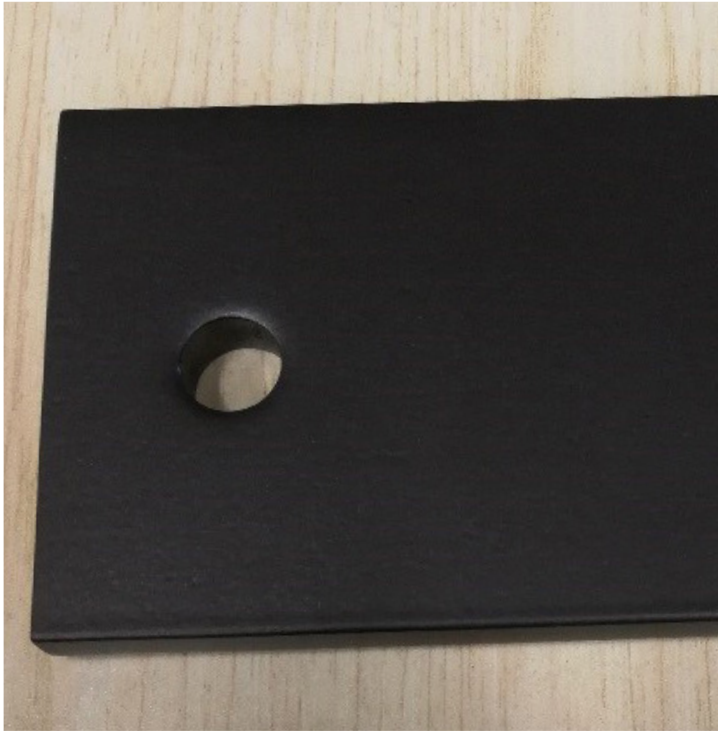
5. Powdercoated (Valspar Anodite 549) stainless steel flat bar used for lightwell guarding.