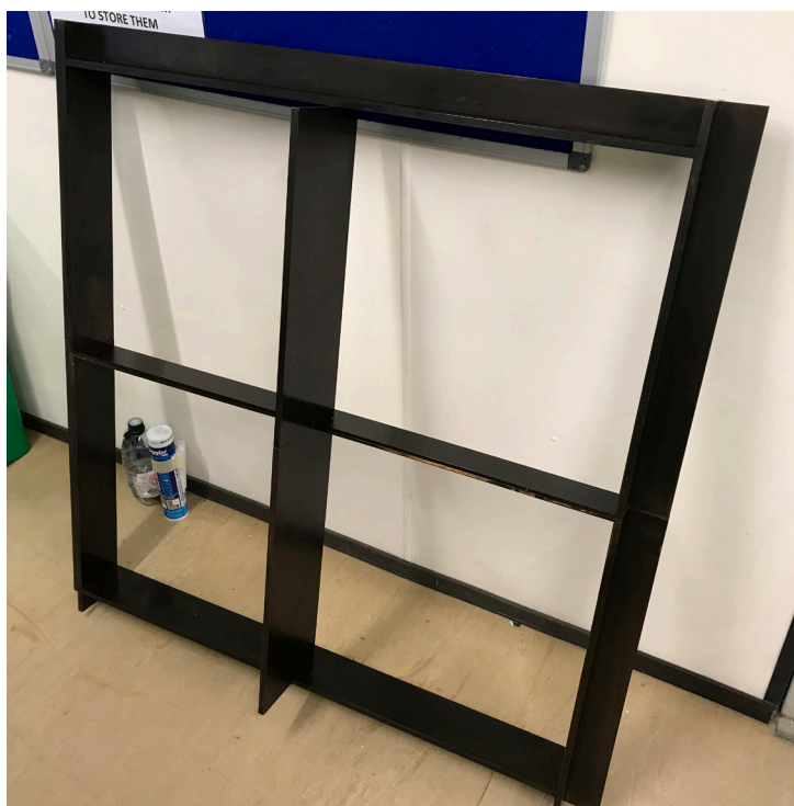
3. Photograph showing sample mock up of Bronze Fin's and Trim construction in Brass OT67 Alloy (67% copper, 33% zinc) pre-patinated - dark to match window frames.