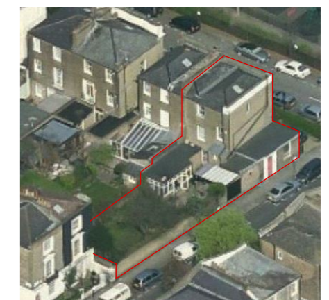
context aerial photographs: 1 Rochester Terrace indicated in red