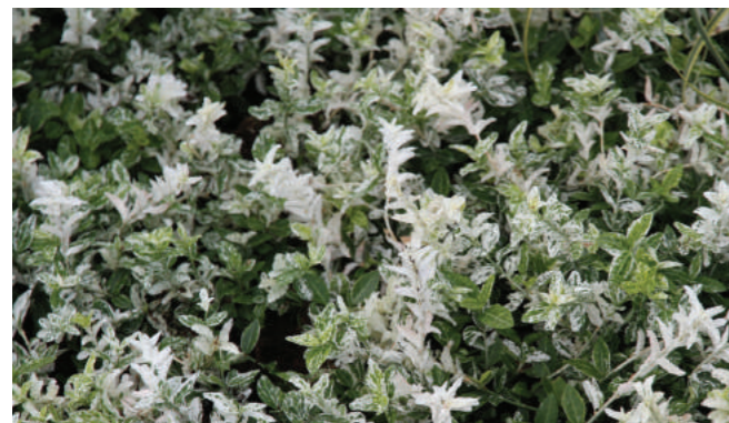
Euonymus fortunei 'Harlequin'