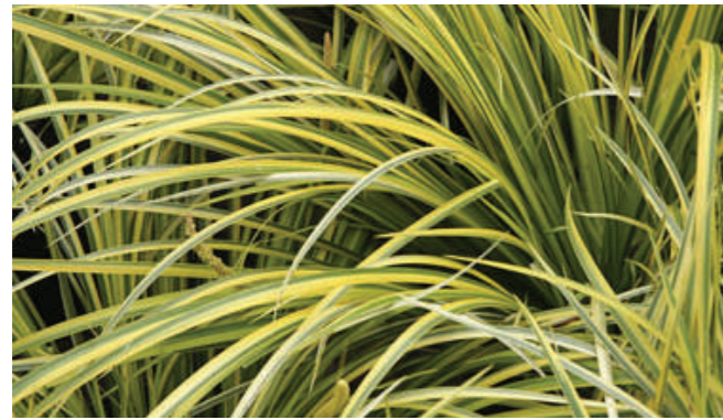
Acorus gramineus 'Verigatus'