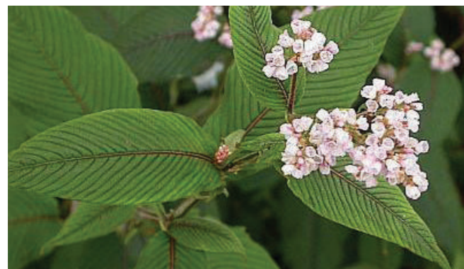
Persicaria campanulata 'Madame Jigard'