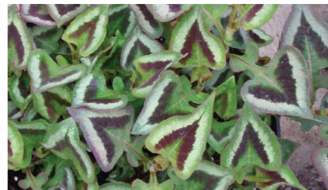
Persicaria microcephala 'Purple Fantasy'