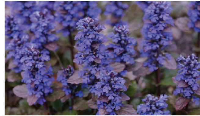
Ajuga reptans 'Catlin's Giant'