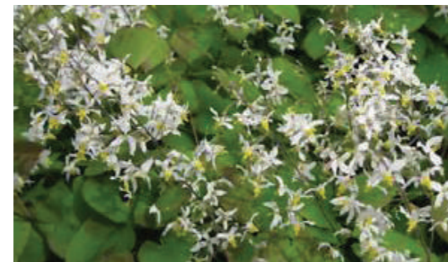
Epimedium stellulatum 'Wudang Star'