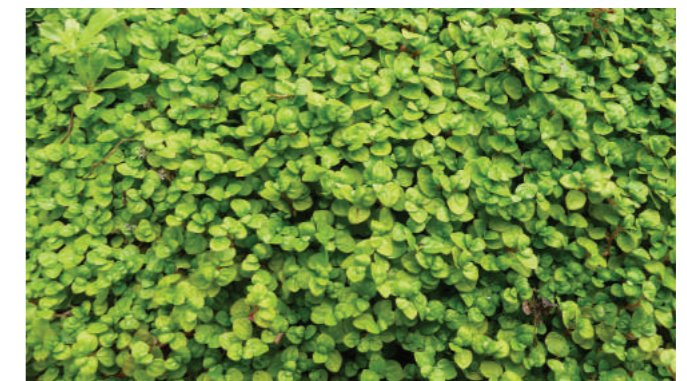
Soleirolia soleirolii (MYOB)