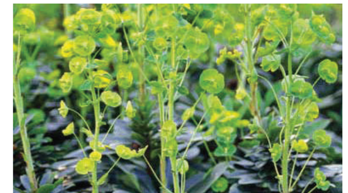
Euphorbia amygdaloids var. Robbie