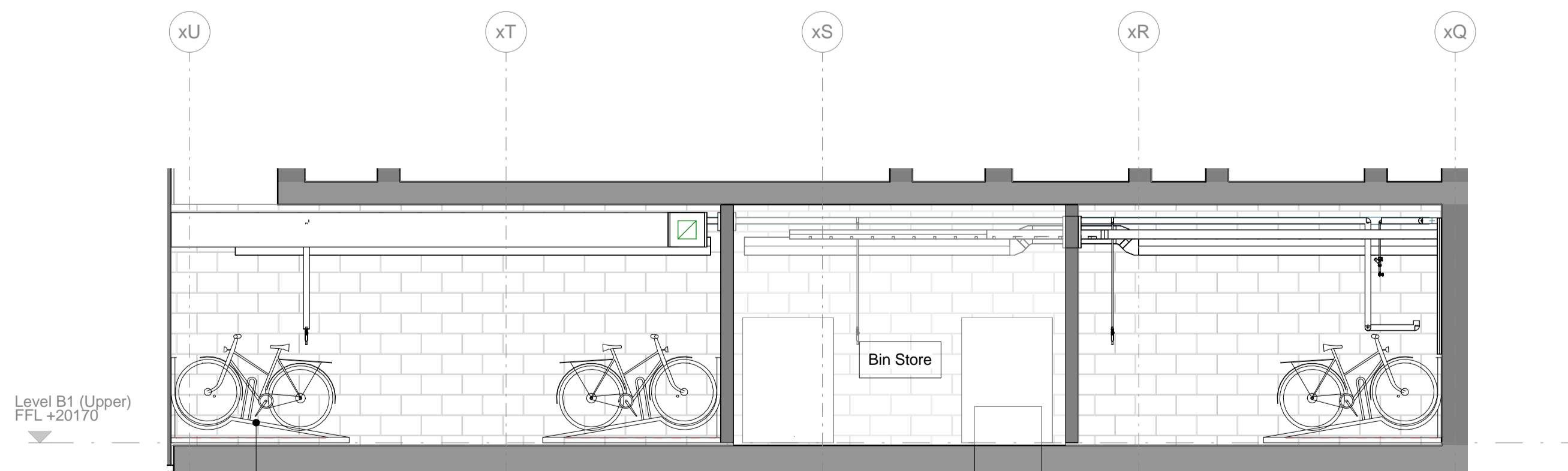
2 Section 02