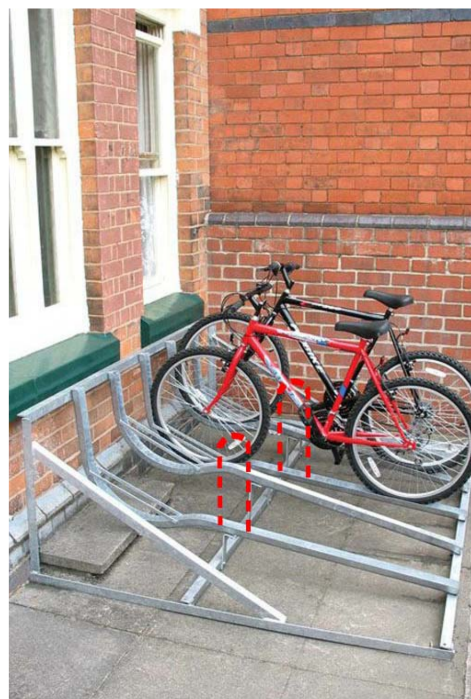
Conway bike rack with additional locking hoop at 340mm centres