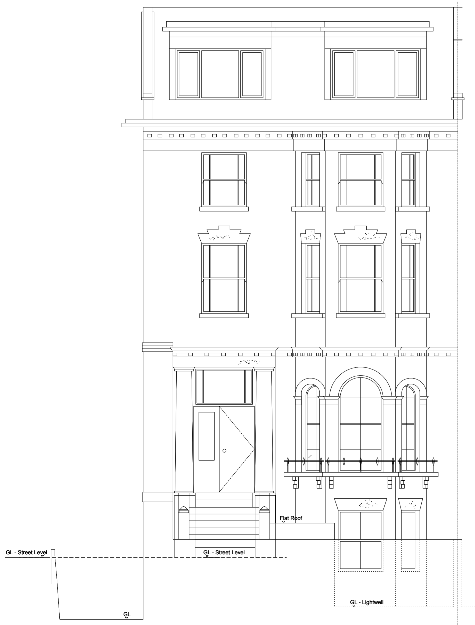
824 01 20 01: EXISTING ELEVATION: FRONT