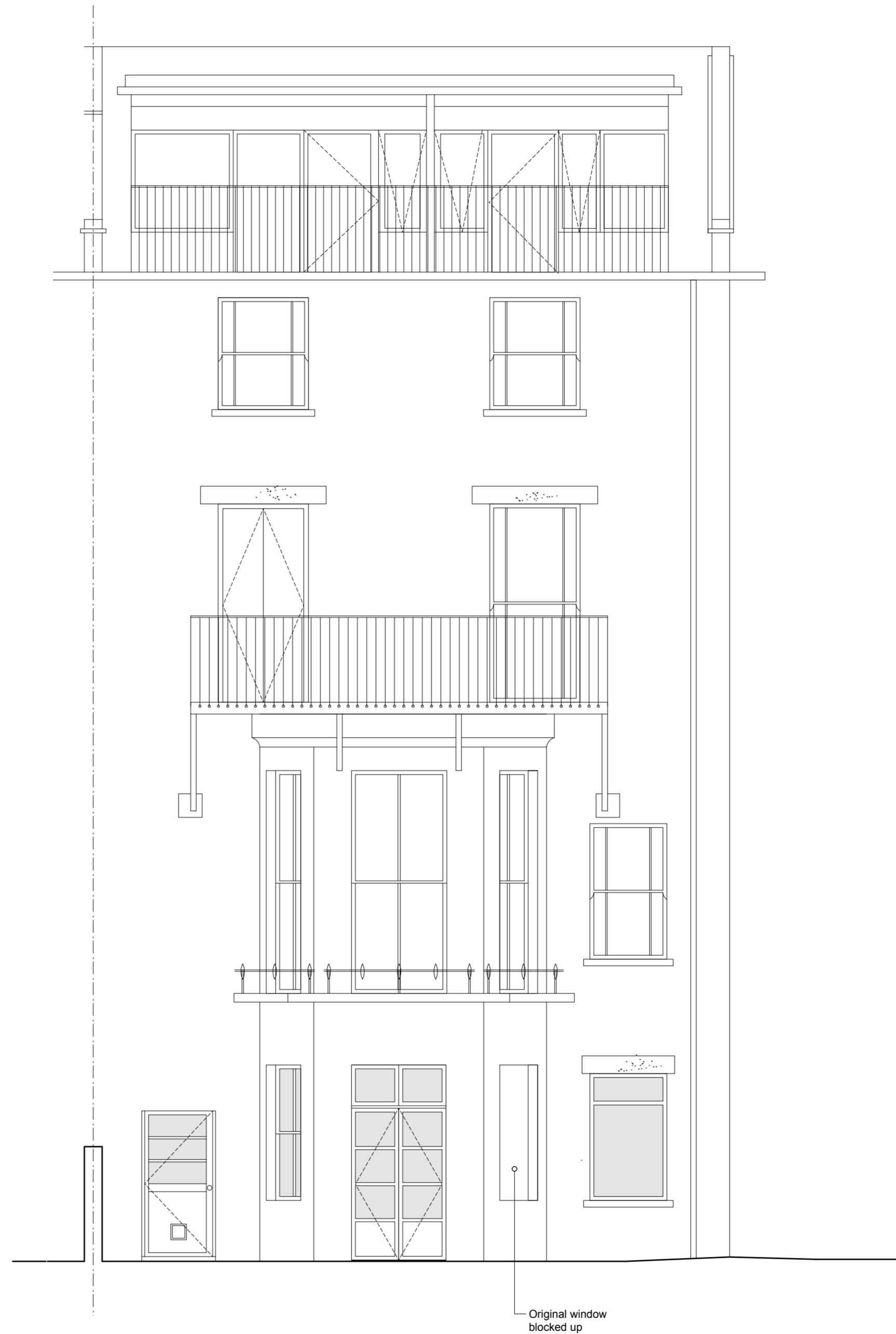
824 01 20 02: EXISTING ELEVATION: REAR