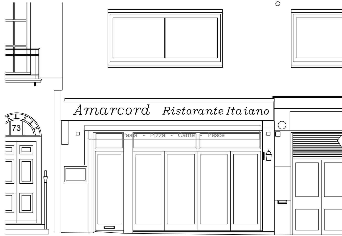
Existing Shopfront scale: 1:50@A3