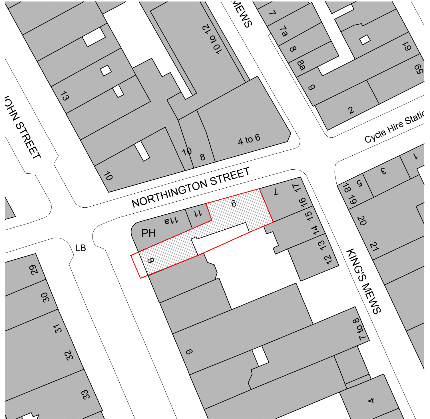
02 BLOCK PLAN 1:500