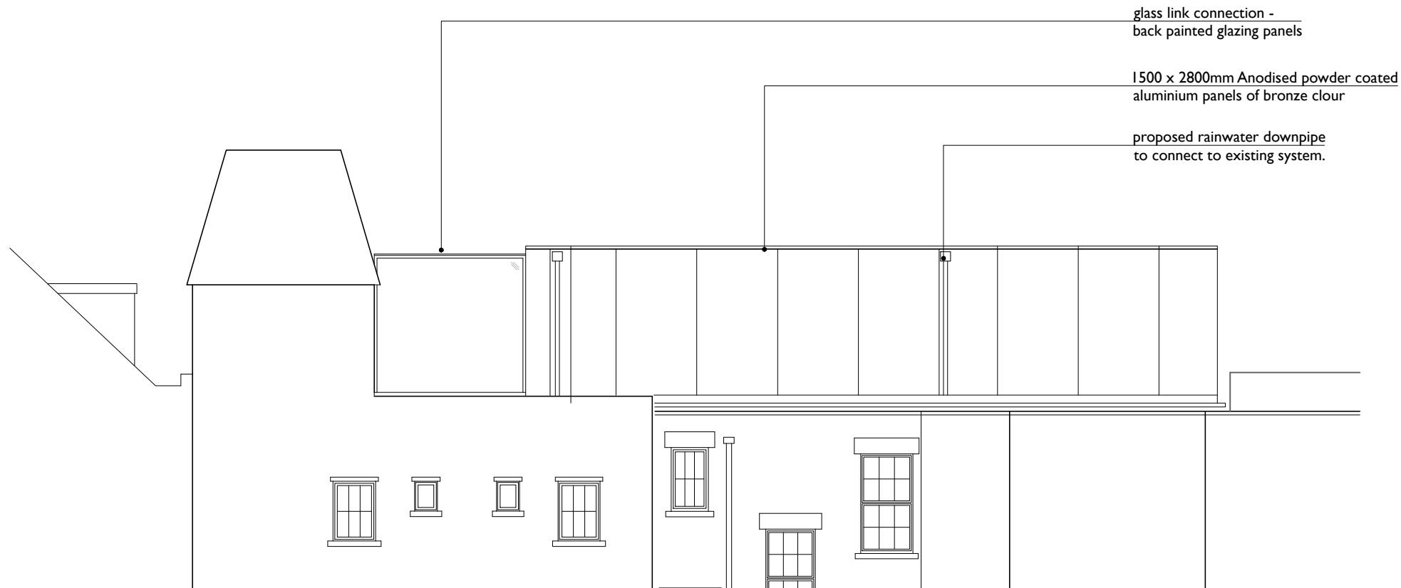
02 PROPOSED SOUTH ELEVATION