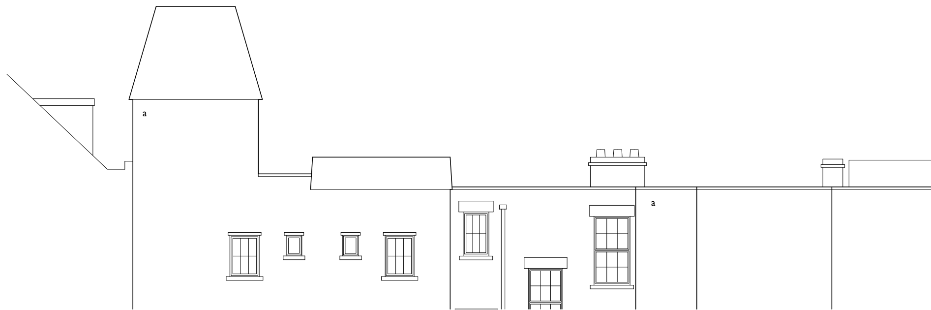
01 EXISTING SOUTH ELEVATION