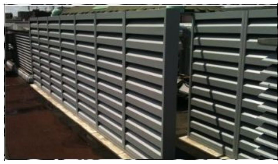
Proposed Acoustic Screen Type Finished in RAL 7040 'Gun Metal Grey'