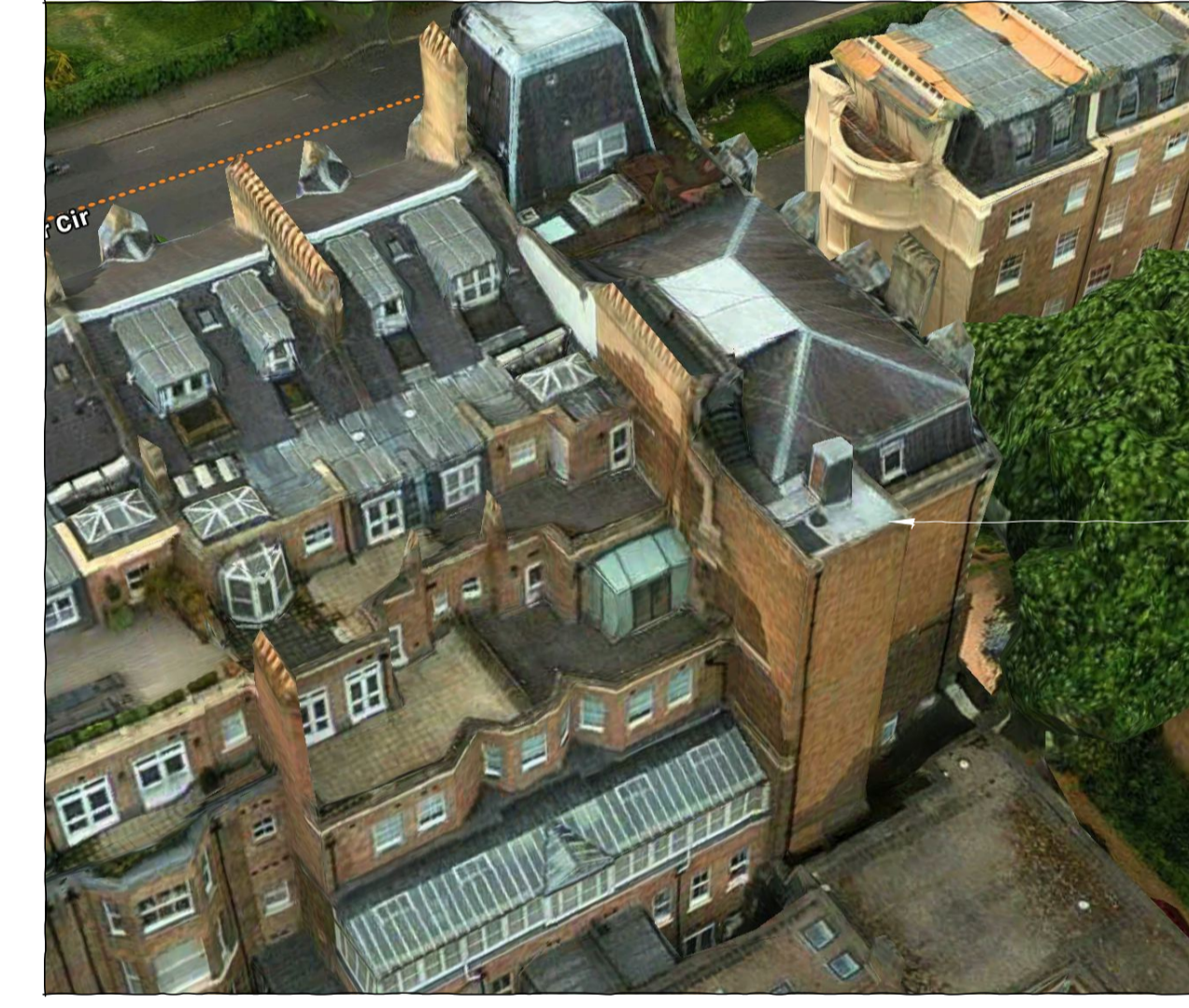
screen capture of aerial photograph taken courtesy of Google Earth