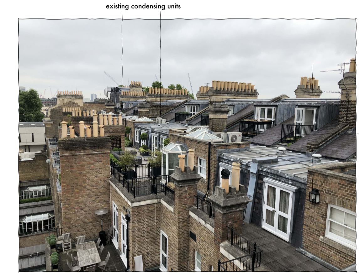
photograph A taken from stair roof level across existing roofscape