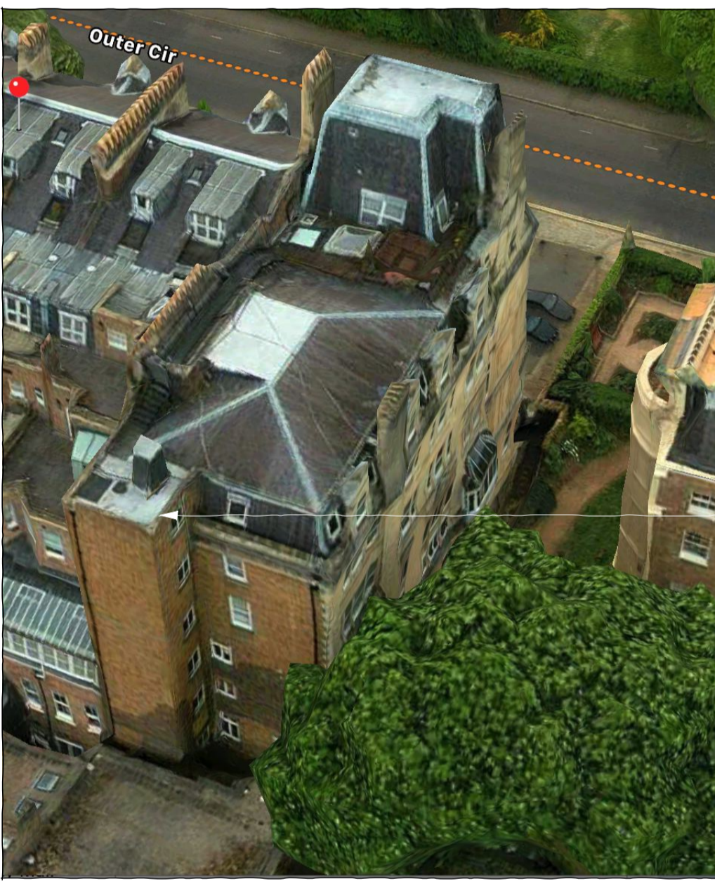
screen capture of aerial photograph taken courtesy of Google Earth