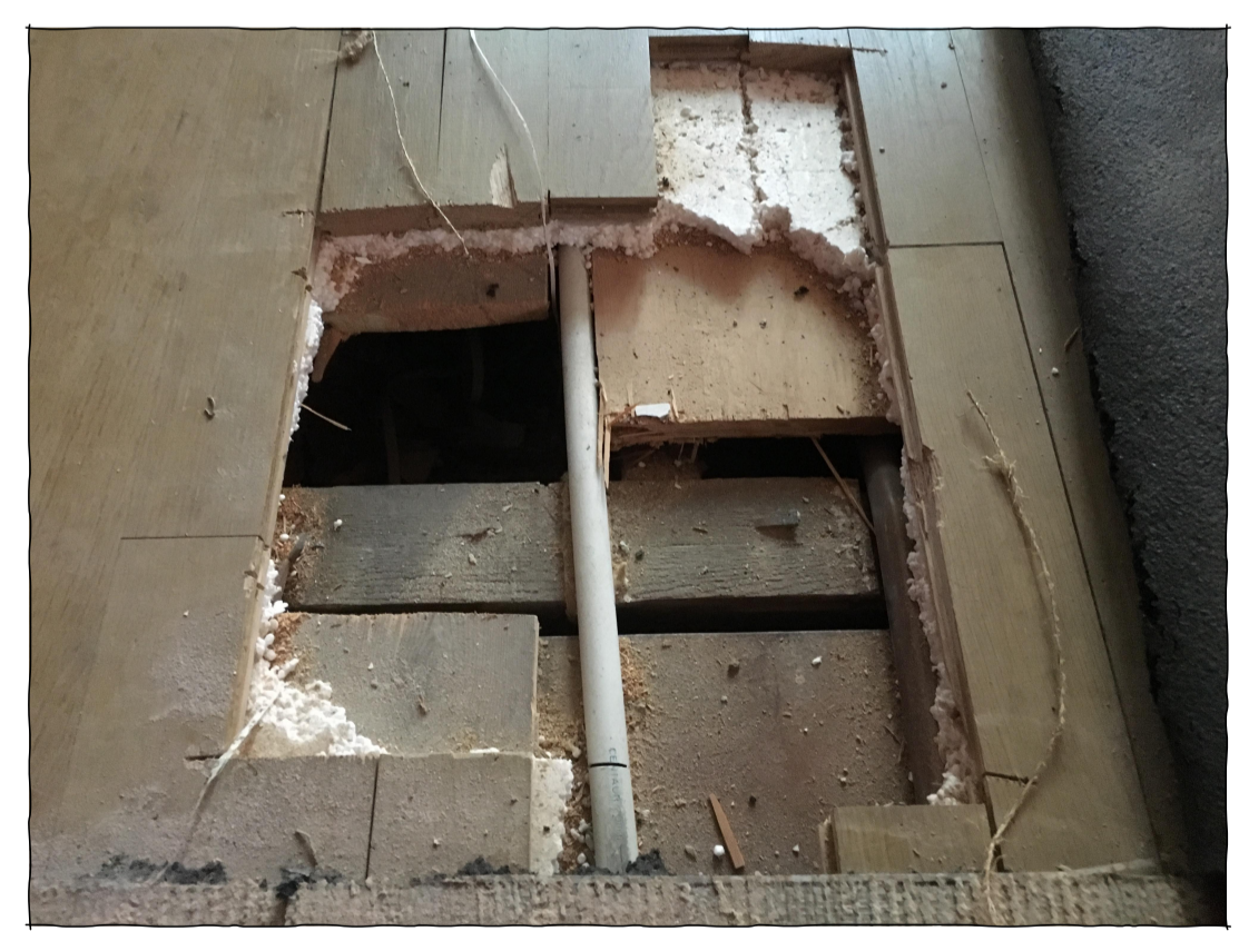
Typical existing floor finishes to be replaced