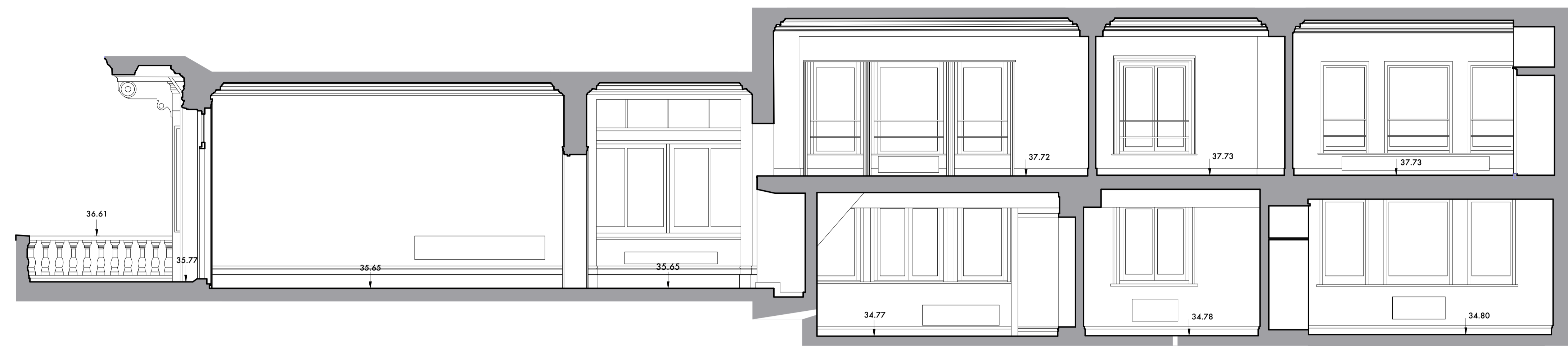
Existing Apartment Section A-A