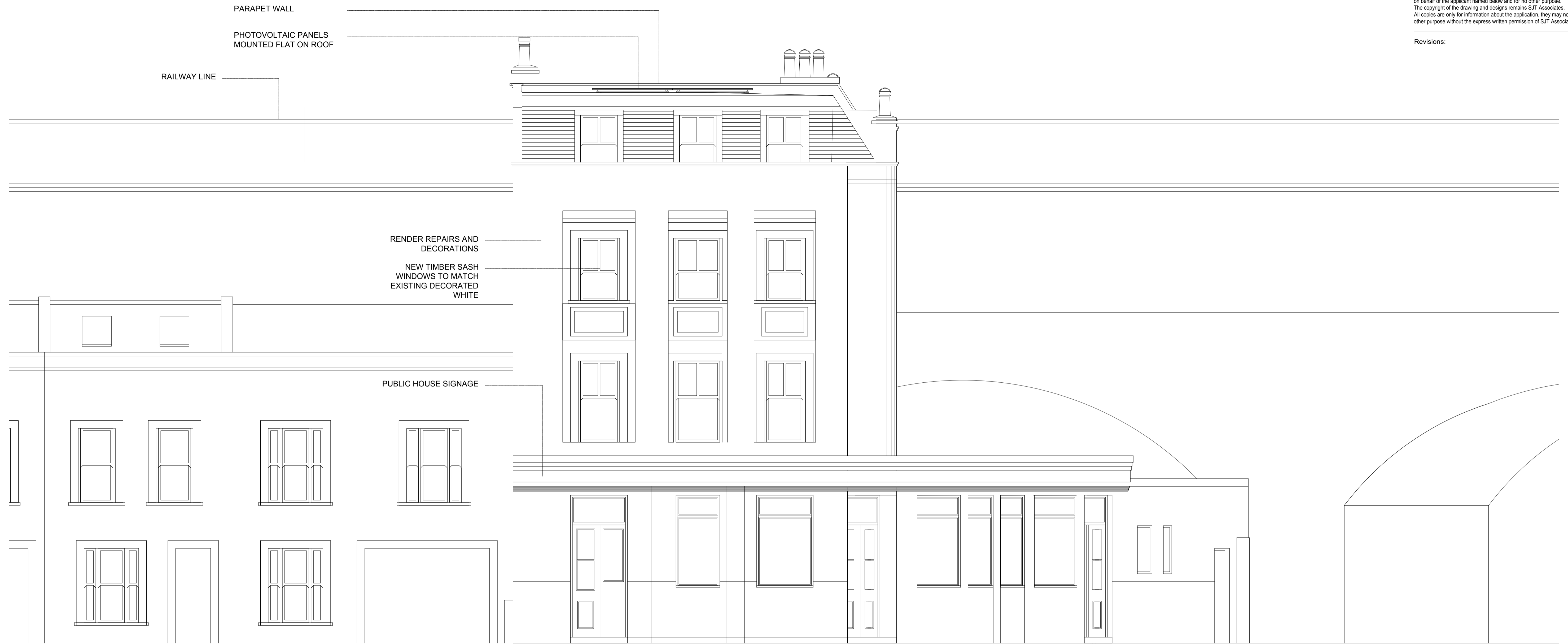
PROPOSED HADLEY STREET ELEVATION