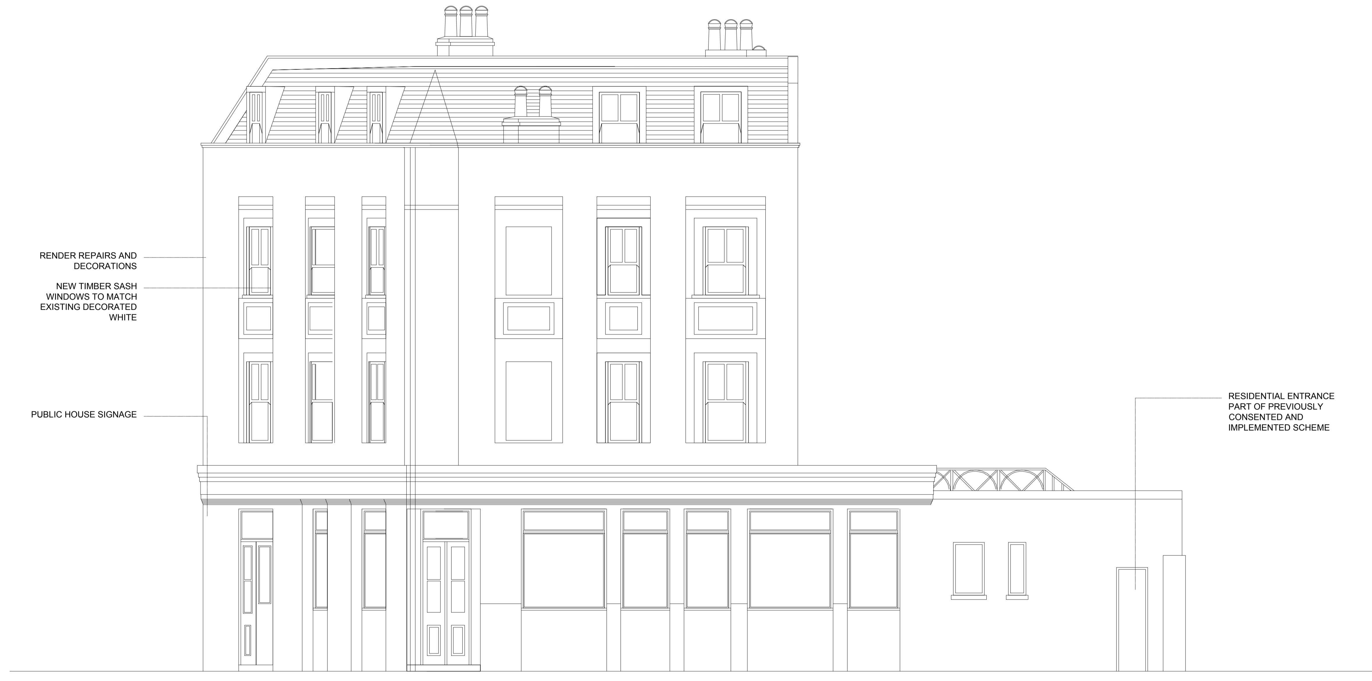
PROPOSED CASTLE ROAD ELEVATION