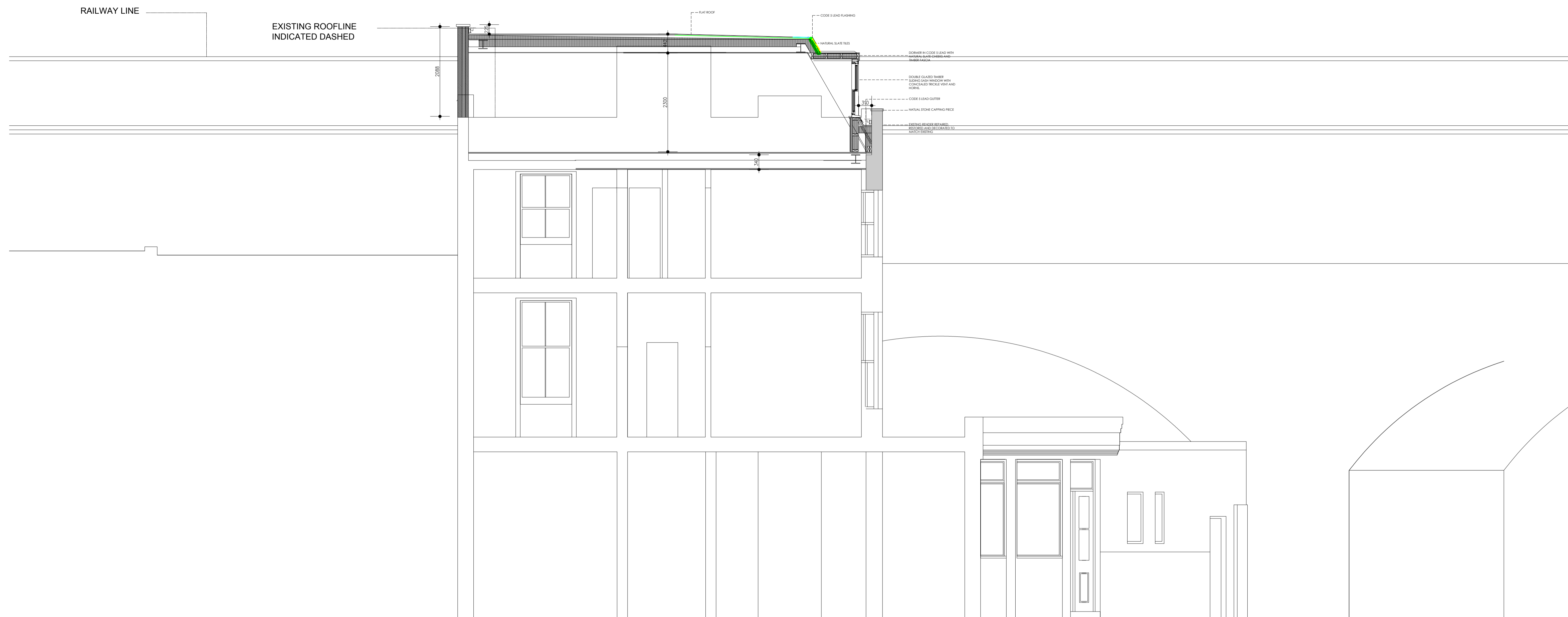
PROPOSED CROSS SECTION B - B