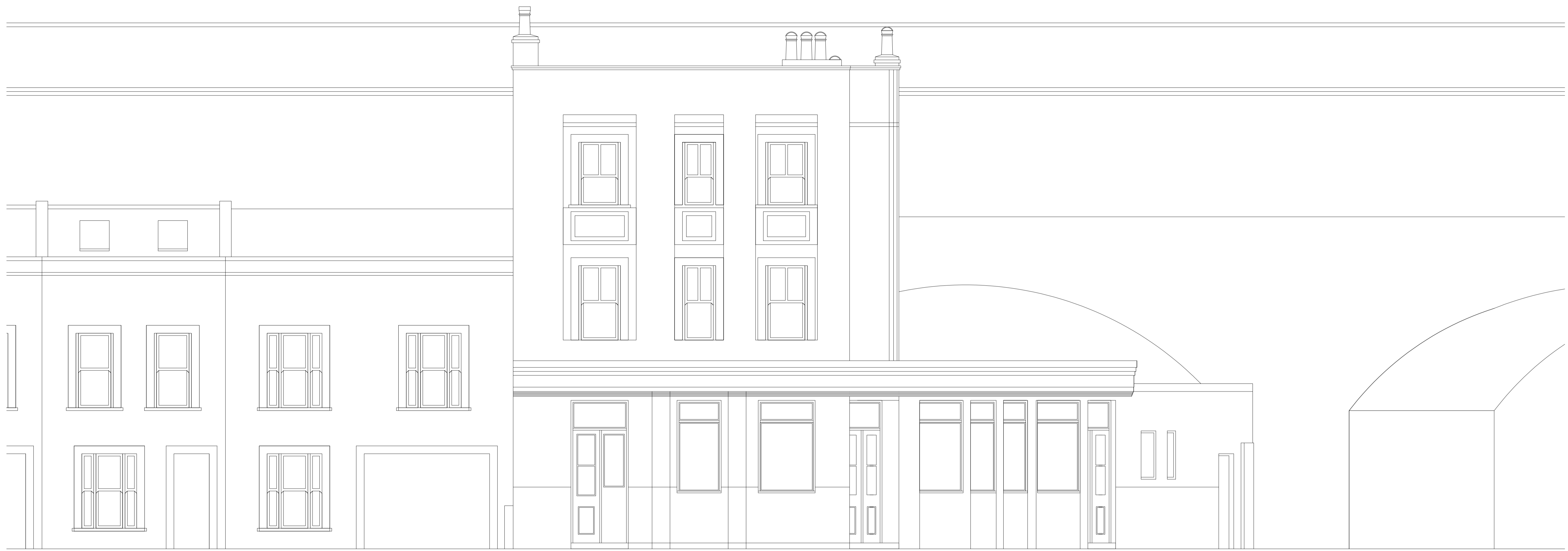
EXISTING HADLEY STREET ELEVATION