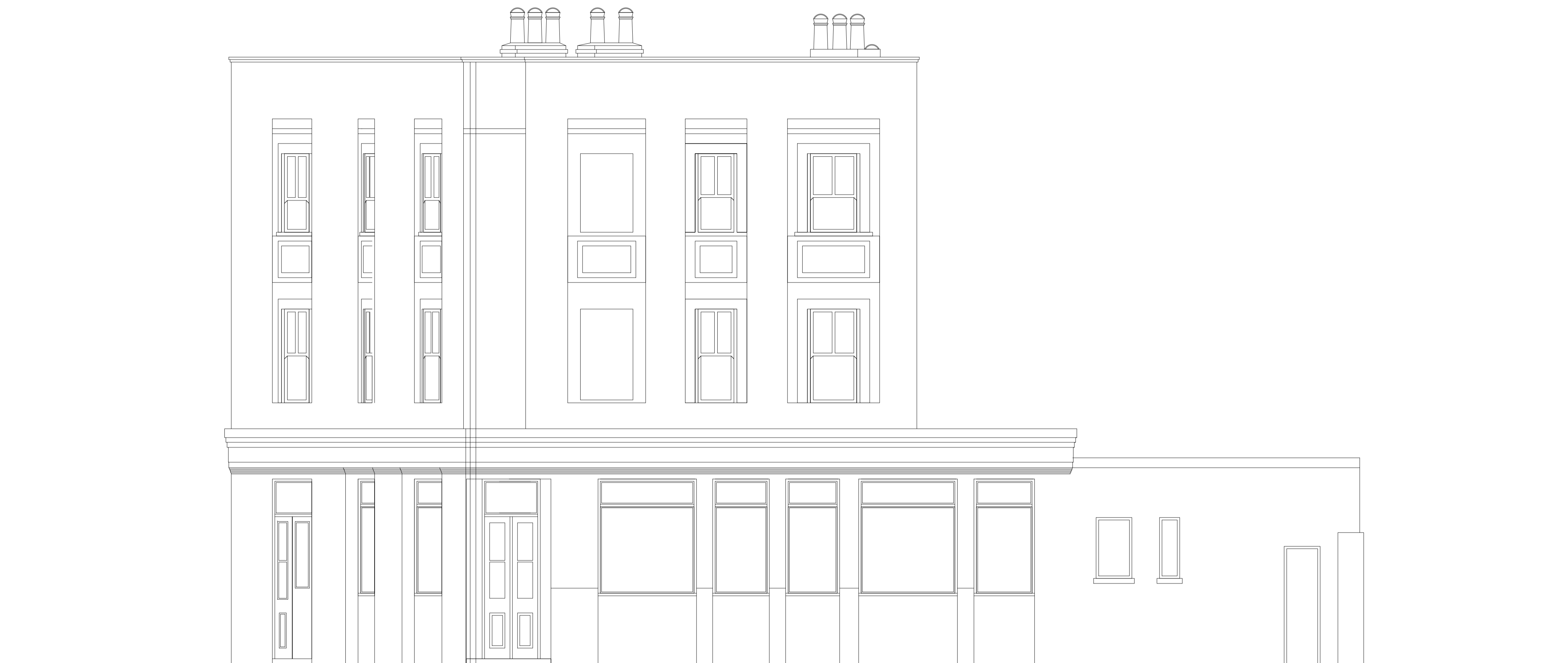
EXISTING CASTLE ROAD ELEVATION