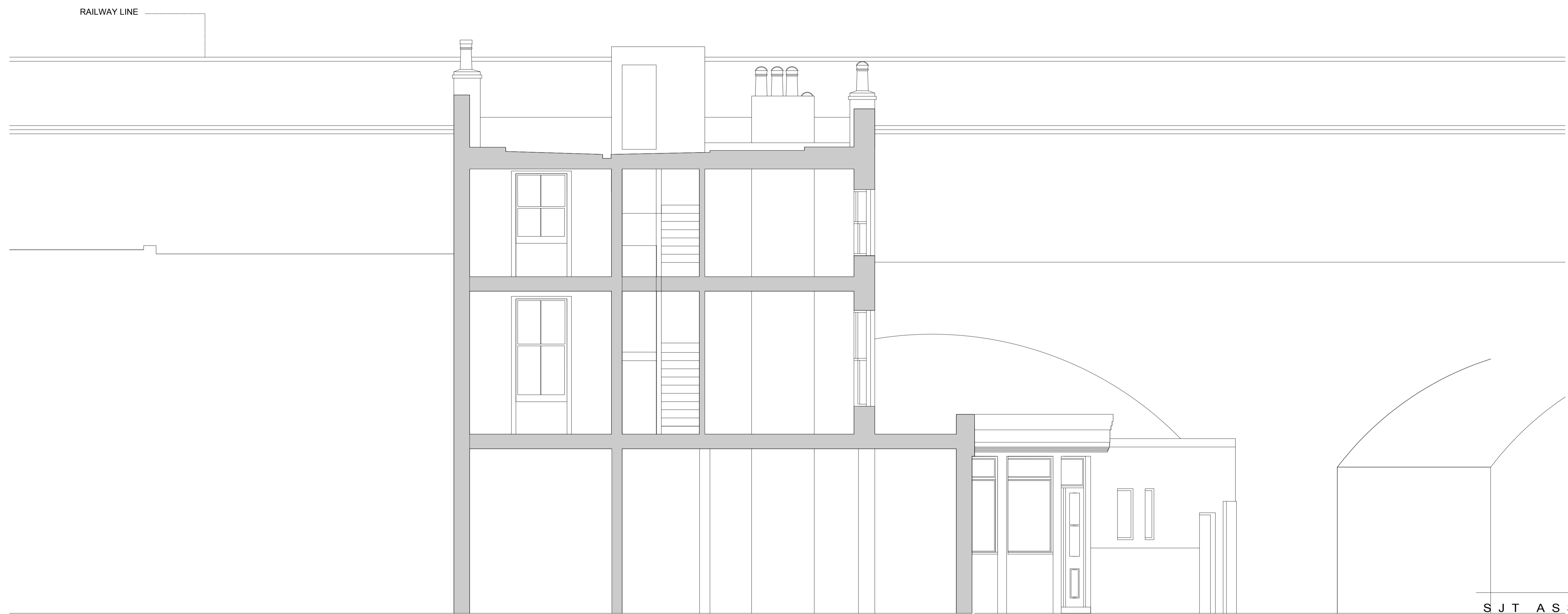
EXISTING CROSS SECTION B - B