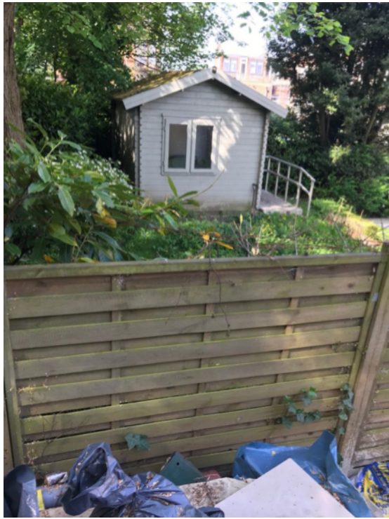
EXISTING OUTBUILDING TO GARDEN OF NO 6 FROGNAL ( THIS IS FORWARD I.E CLOSER TO REAR ELEVATION THAN PROPOSED OUTBUILDING )