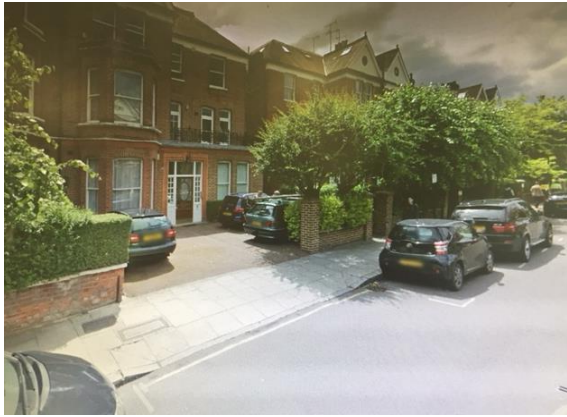
Picture – 87 Canfield Gardens