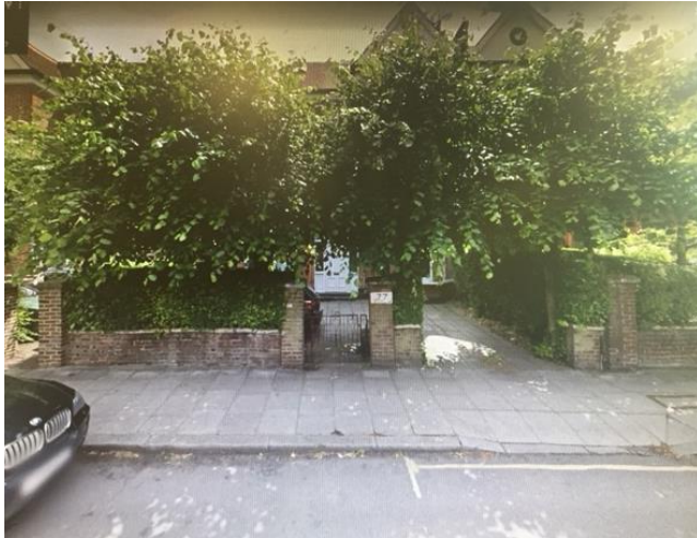
Picture – Front view of 77 Canfield Gardens

The below are possible reasons why the public are blocking the driveway: