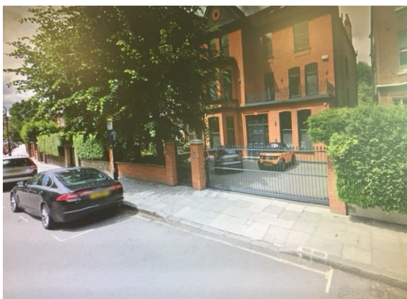
Picture – 71 Canfield Gardens