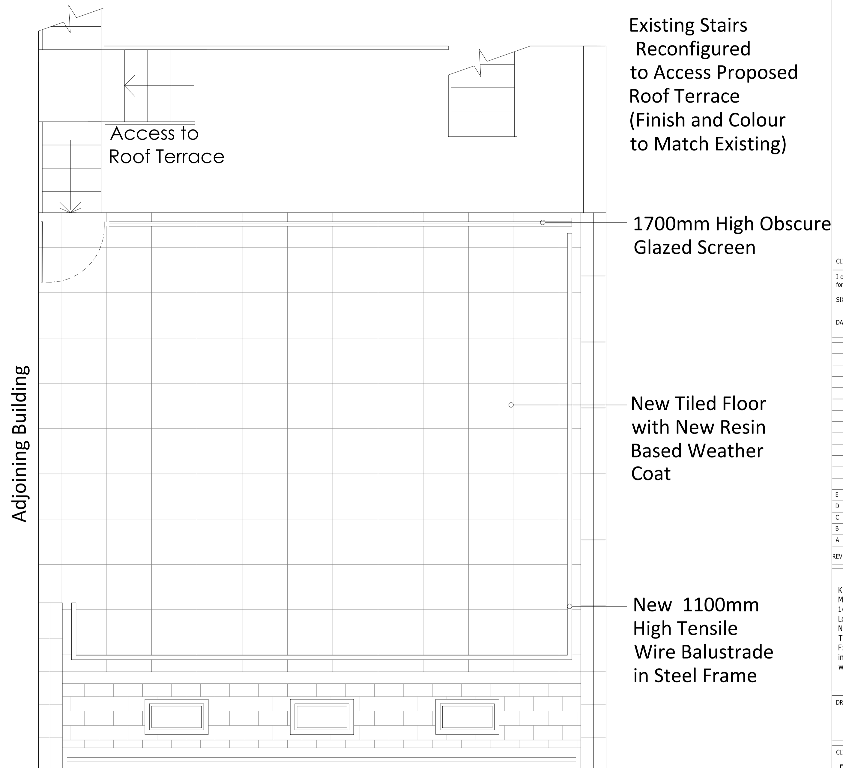
Proposed Roof Plan