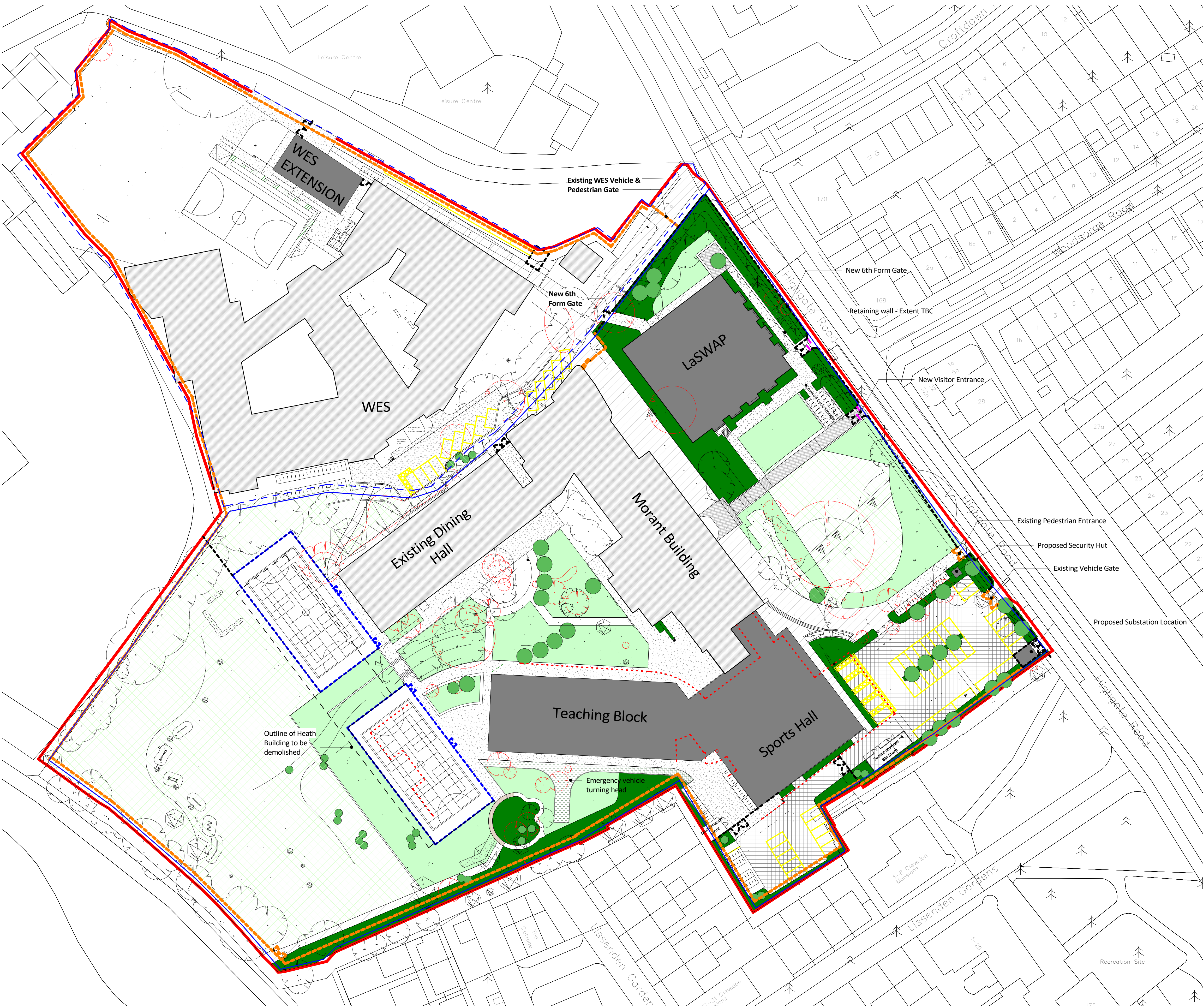
1. Proposed Site Plan SCALE - 1 : 500@A1