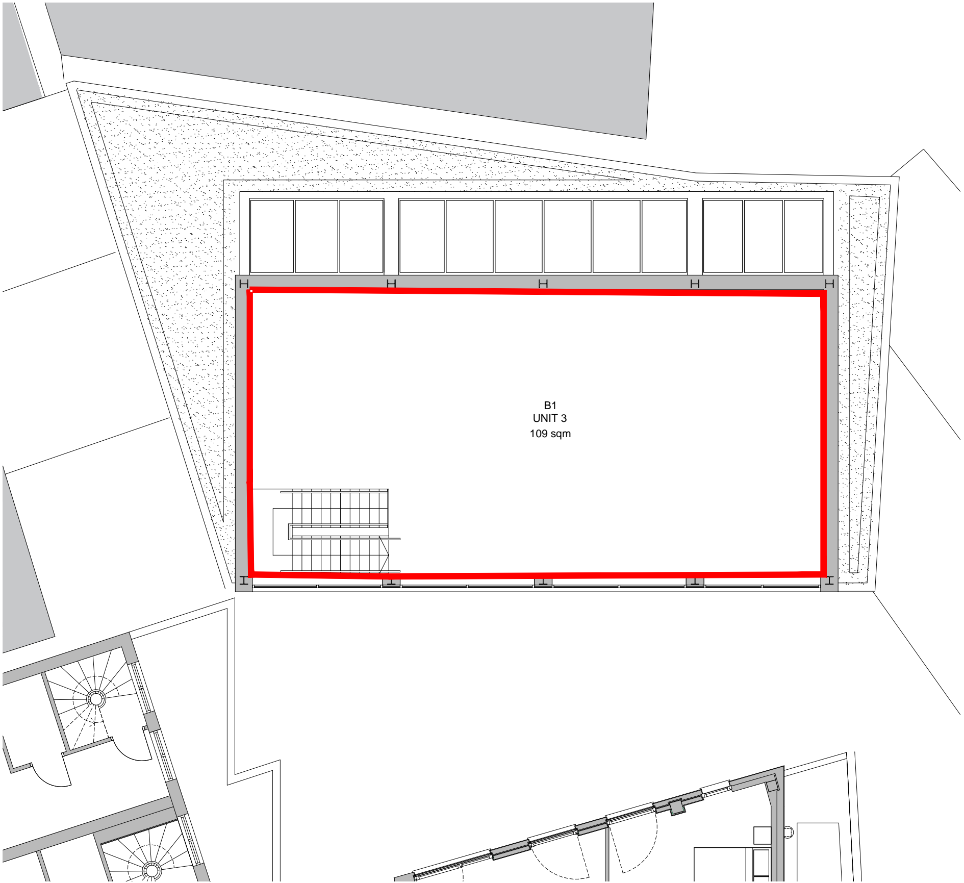
23(01)E003 01 Existing First Floor Plan