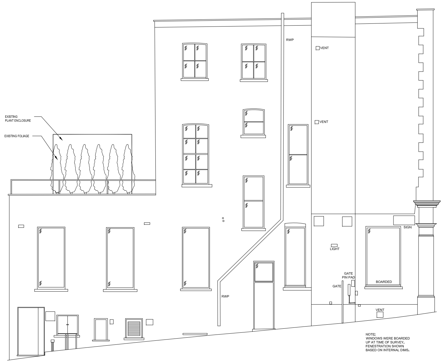
EXISTING ELEVATION A (Scale 1:50 @ A1)