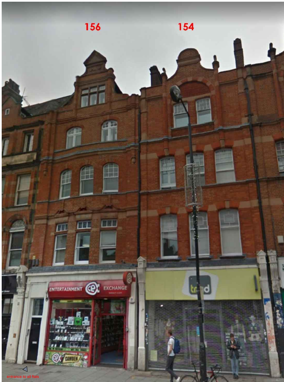
VIEW 1 ELEVATION TO CAMDEN HIGH ST.