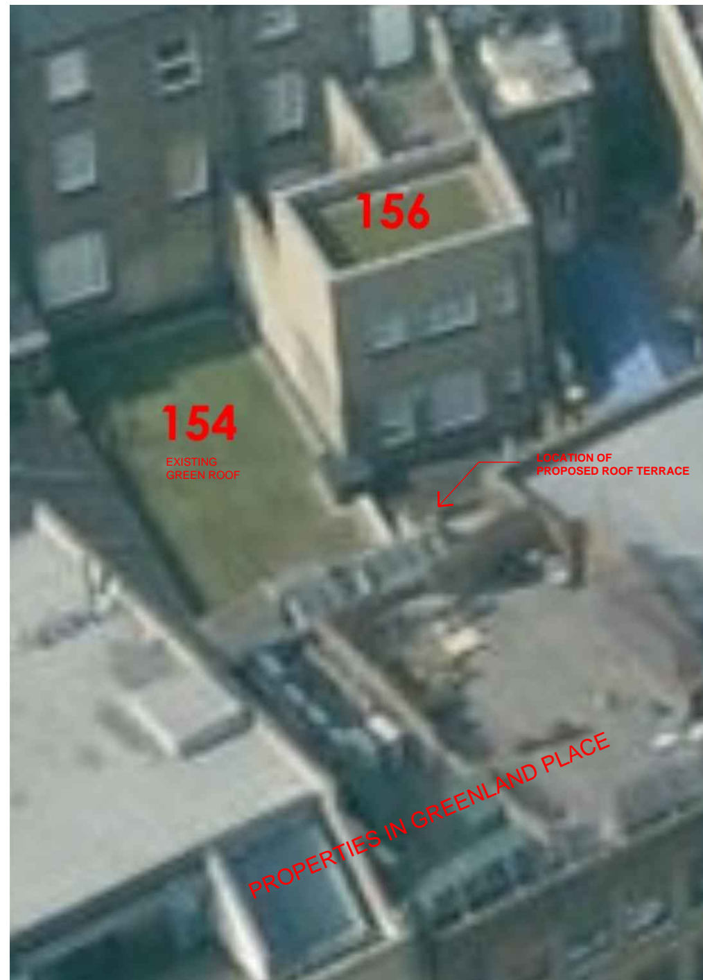
VIEW 2 EXISTING FLAT ROOFS TO REAR OF 154-156 CAMDEN HIGH ST. & ROOFTOPS TO PROPERTIES IN GREENLAND PLACE