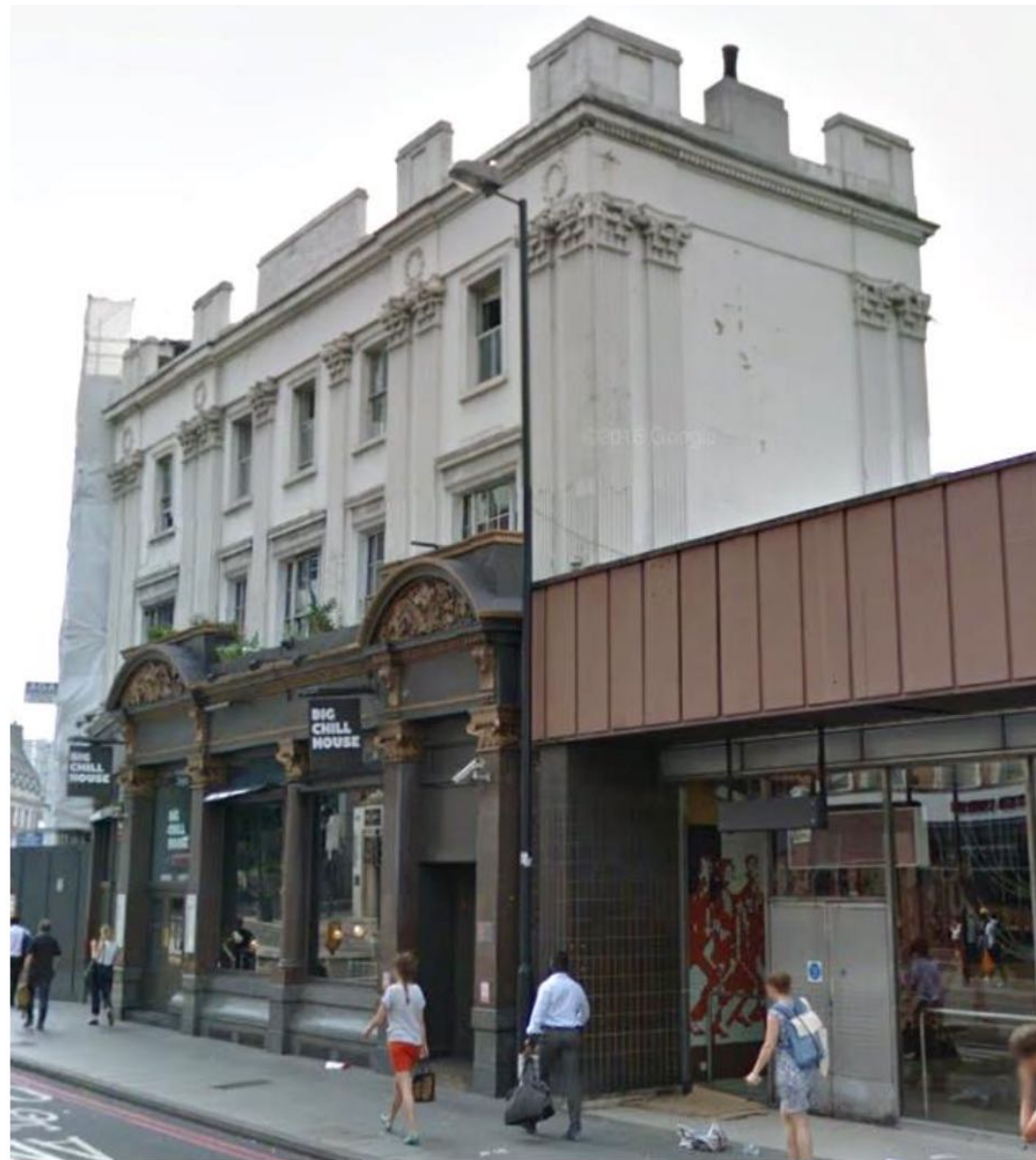
4 EXISTING PHOTO OF AREA