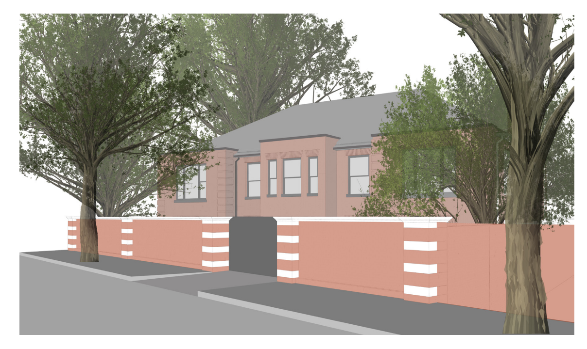
Front elevation as proposed in brickwork - above

Rear elevation as constructed in accordance with approved plans - below