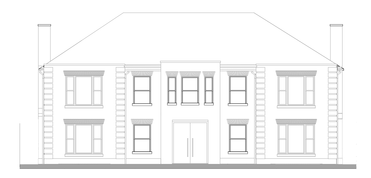
As proposed front elevation in current application - above

We believe this approach gives the house a coherence and integrity to it's design that is not visible in the currently approved scheme (detailed on the previous page).