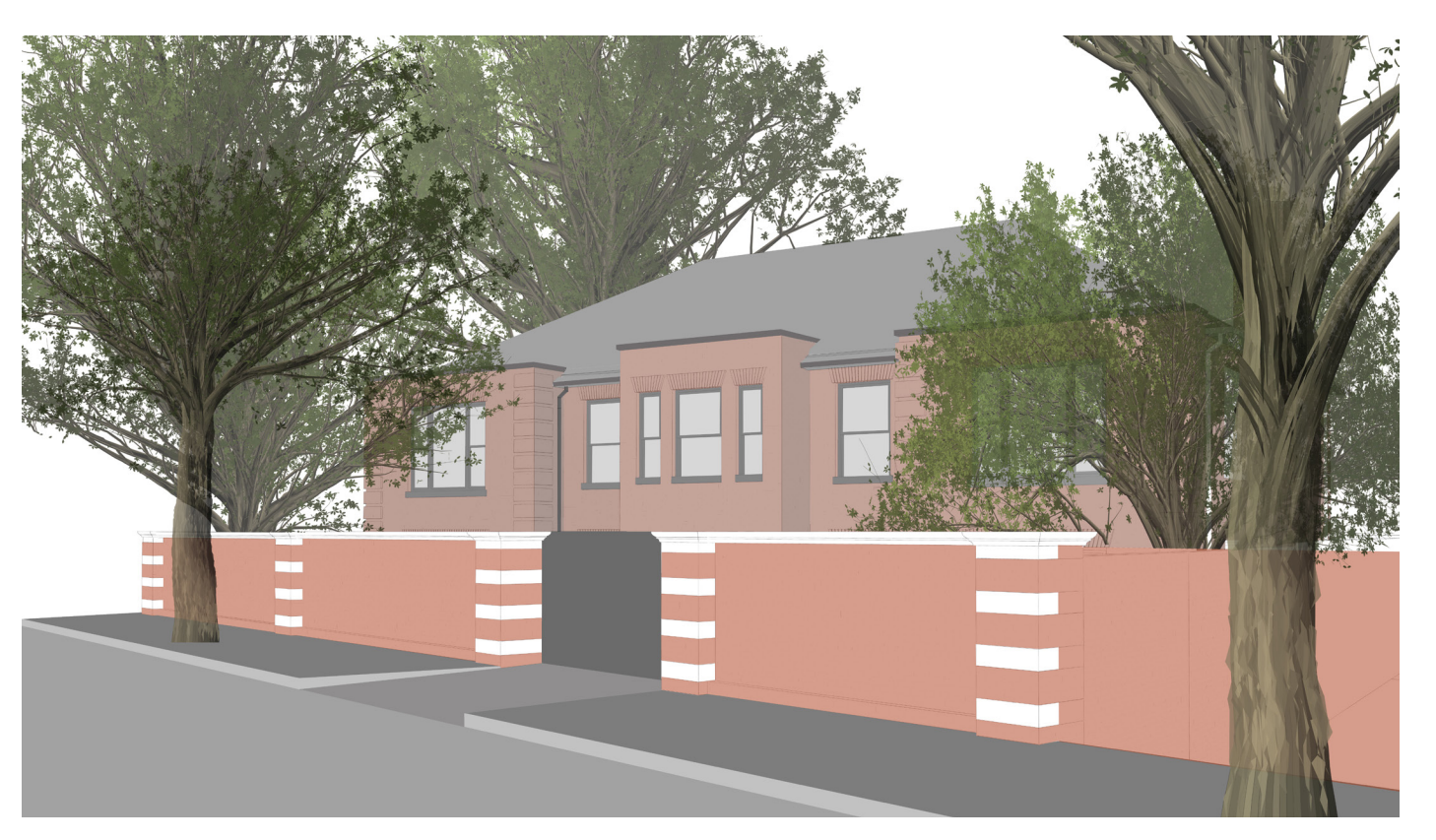
Front elevation as proposed in this application in brickwork - above