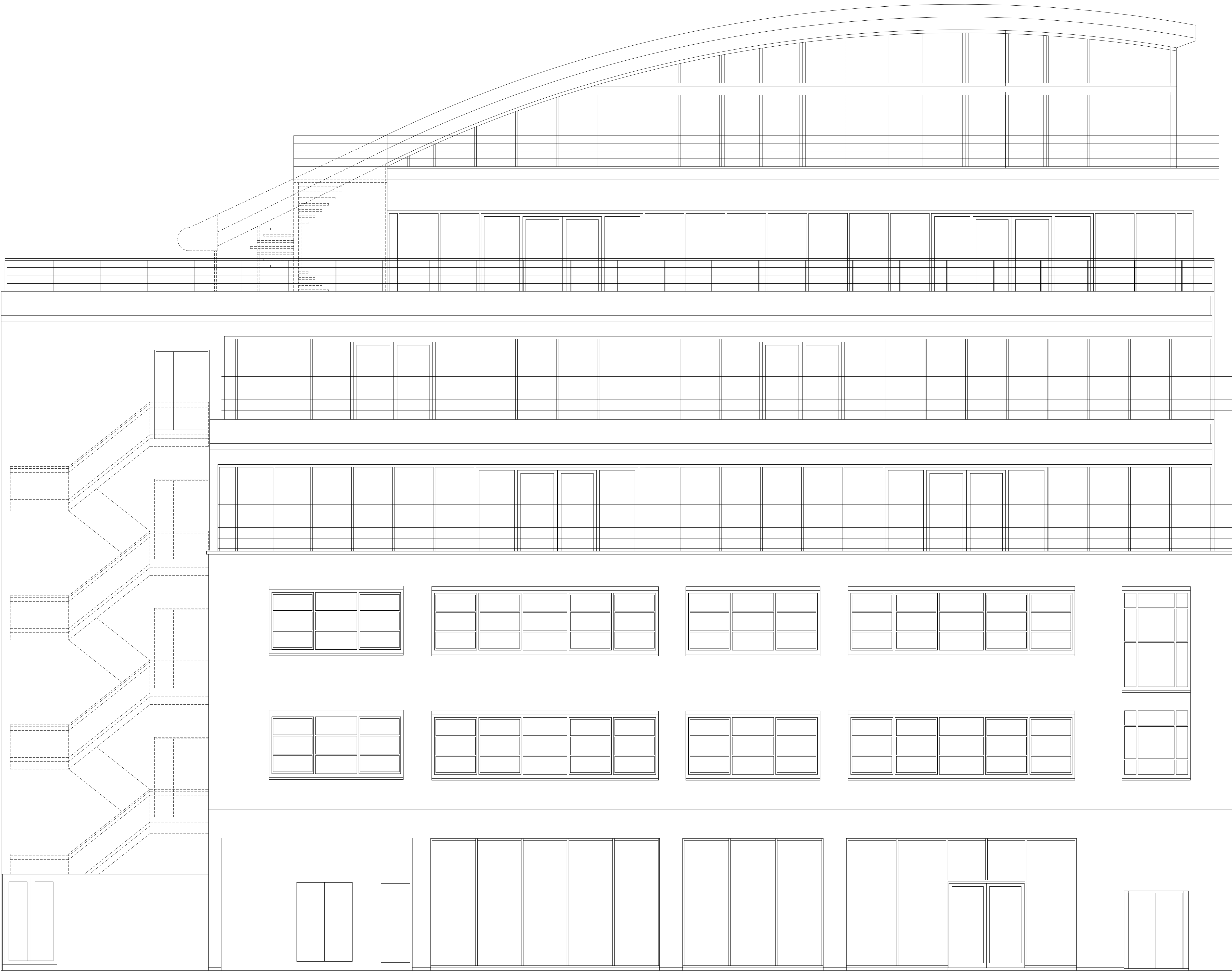
SAFFRON HILL ELEVATION